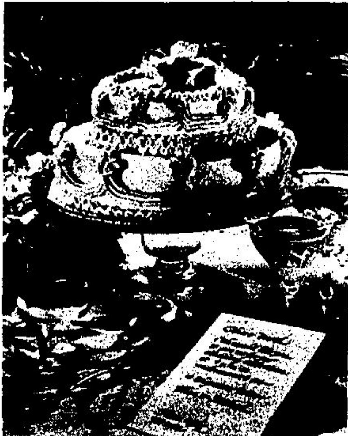
A VERY SPECIAL WEDDING CAKE is one you bake yourself! With the help of a Super Shooter® electric foodgun from Wear-Ever, it's easy to fashion festoons, garlands, and rosettes on your one-of-a-kind cake.

To round out the refreshment table, use the electric foodgun to create platters of elegant canapés. For best results, make a variety of mixtures a few days before the wedding, and store them in the refrigerator in the extra