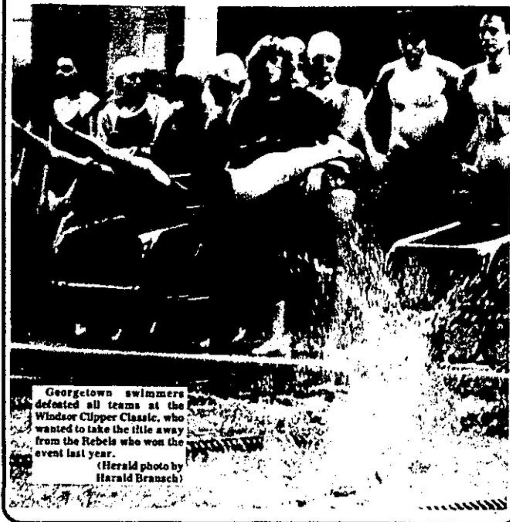
Georgetown swimmers defeated all teams at the Windsor Clipper Classic, who wanted to take the title away from the Rebels who won the event last year.

Swim team captures prestigious title for second straight year