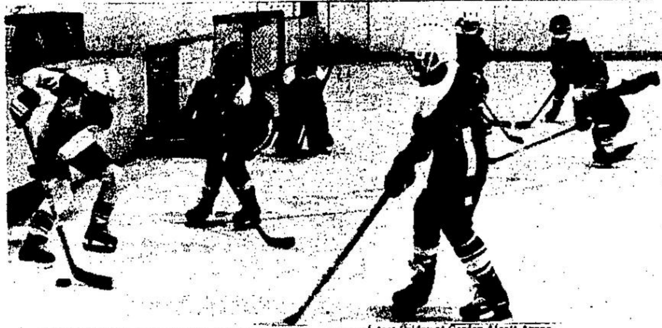
Novice house league players from Williams Electric (dark sweaters) and Harris Systems were seen battling over the puck last Friday at Gordon Alcott Arena.

EDITOR'S NOTE: In preparation for Minor Hockey Week in Canada, The Herald interviewed the presidents of both the Georgetown Support Group (Rep) hockey and the Georgetown District Minor Hockey Association (GDMHA - House League, Tier 2, Selects).