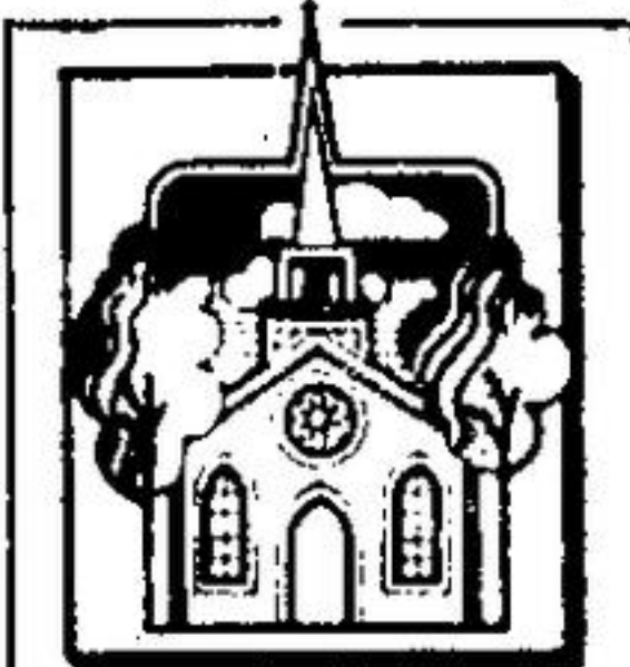
Nineteenth in a series

Established in the 19th century, Ballinafad's farming community has been undergo-