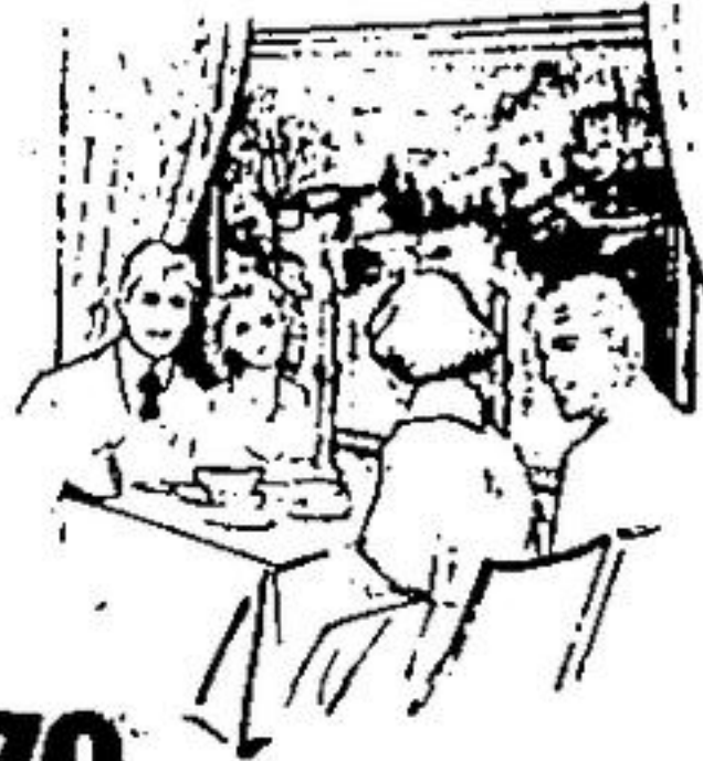
TABLE & TAKE OUT SERVICE OPEN 7 DAYS A WEEK (REASONABLE PRICES)