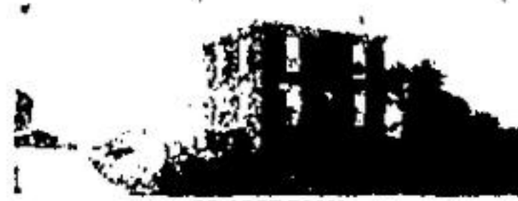
38 ACRE FARM Near Ballinacra. Good buildings, good land, good road and mortgage to qualified purchaser. Asking $192,500.