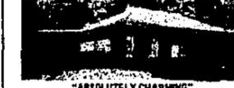
"ABSOLUTELY CHARMING" Surrounded by bush for privacy. This immaculate bungalow with main floor laundry room, plus beautiful main floor family room with fireplace, 2 walkouts to large cedar deck, large Knotty Pine kitchen. $50,000.00 - 10% mortgage near Ballinacra. Asking $89,000. On a half acre lot.