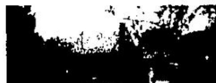
1 1/2 PICTURESQUE ACRES NEAR TERRA COTTA Brick and wood 1 1/2 storey home featuring main floor study and adjoining bedroom. Upper level converted to a completely self contained apartment. Hardwood floors with new broadloom, 2 car garage. $50,000 1st mortgage at 11% due Nov. 1984. Asking price $117,500.