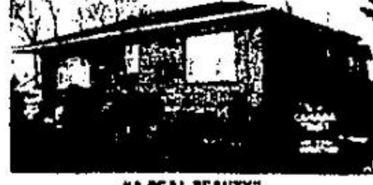
"A REAL BEAUTY" Solid brick maintenance free immaculate 3 bedroom home, large family size kitchen and a gorgeous knotty pine rec room, wet bar and wall to wall stone fireplace. This bungalow is sure to please. 2 bathrooms, large fenced lot. $40,000.00 1st mortgage. Asking $74,900.