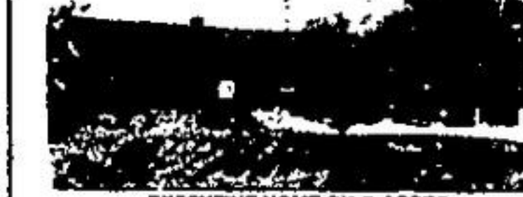
EXECUTIVE HOME ON 3 ACRES Built by an executive for an executive. I owner home, spotless, 3 bedroom ranch bungalow, extra large livingroom with dining area. Eat-in kitchen, fully finished basement, rec room has franklin fireplace, detached 2 car garage with workshop. 3 acres fully landscaped, lots of room for that garden and fruit trees. For details call 877-9500. $129,900.