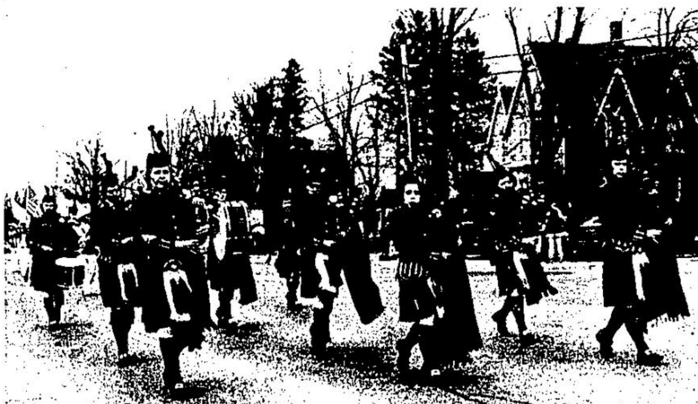
Ever popular at parades and numerous other events throughout town, the Georgetown Girls Pipe Band was once again at the annual Santa Claus parade in Georgetown last Saturday. Spectators braved the numbing cold wind to line up from Moore Park Plaza, down through Main Street and all the way into the Georgetown Market Place to get a chance to wave at St. Nick as he rode by on his float.