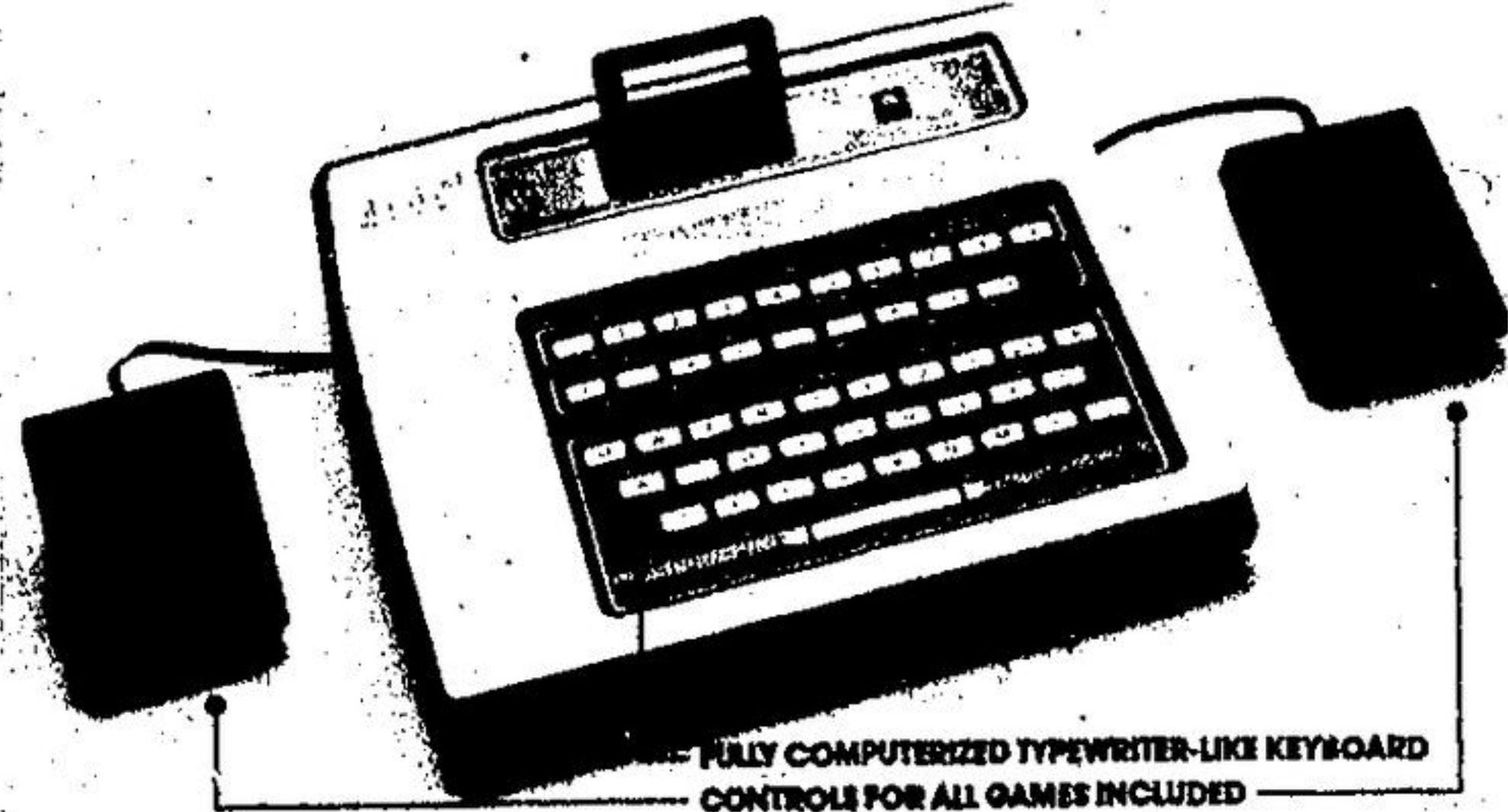
FULLY COMPUTERIZED TYPEWRITER-LIKE KEYBOARD CONTROLS FOR ALL GAMES INCLUDED

Odyssey 2 is the most sophisticated home video game in its class. Its capabilities are mind boggling. Compare Odyssey 2 the complete computer video game system, to the video game of one of its leading competitors. You'll see why we say the technologically advanced Odyssey 2 is the best buy on the market today.