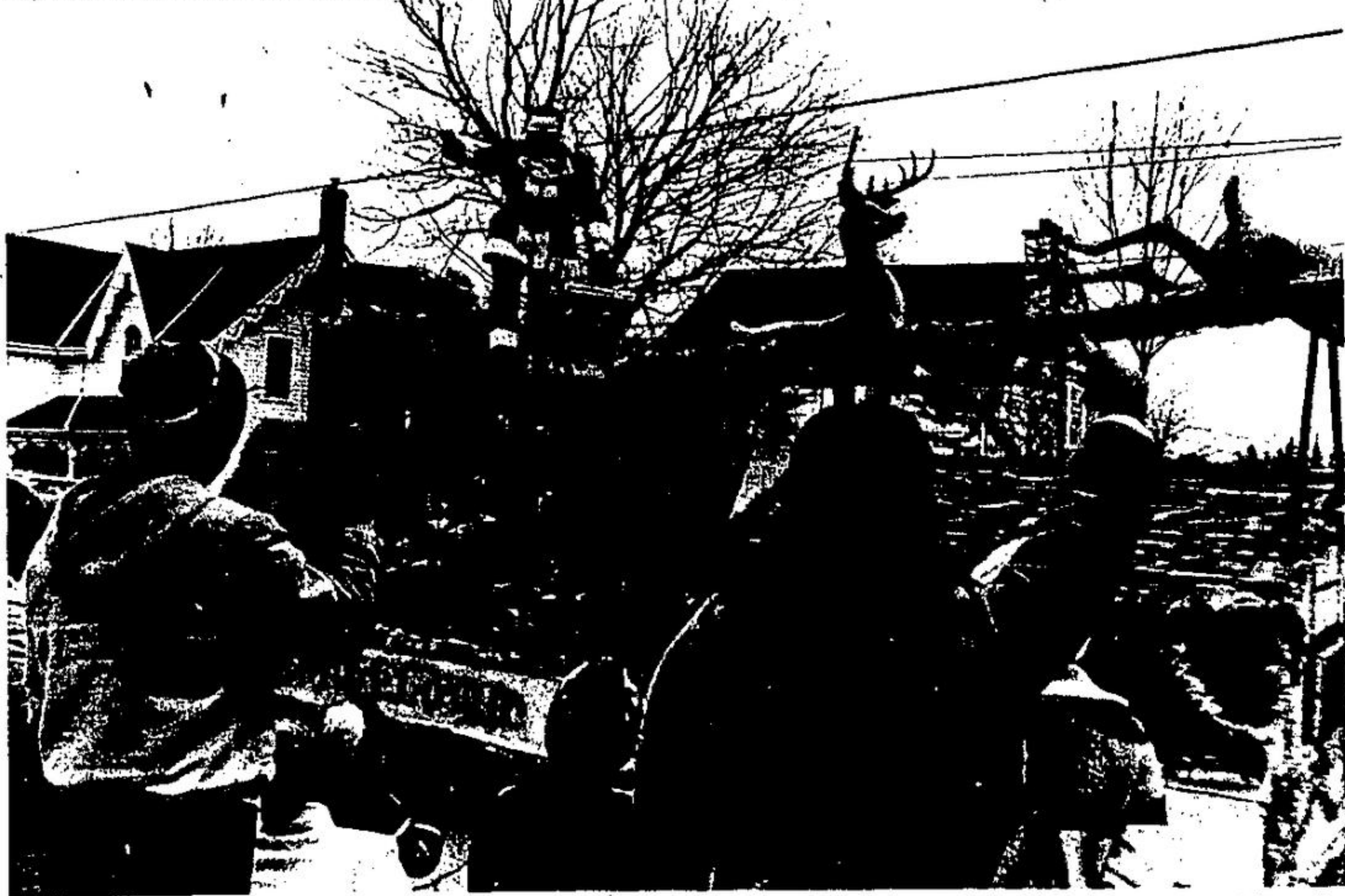
Eyes sparkled like so many Christmas tree decorations when Santa rode by in his float during the Santa Claus parade in Georgetown Saturday. When the parade wound up at the Zeller's outlet in the Georgetown Market Place, he