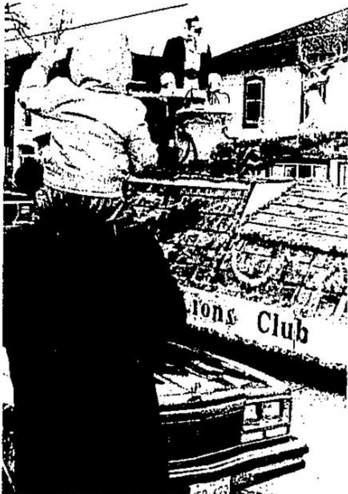
This little toddler was like several hundred others in Georgetown Saturday afternoon, offering a beaming welcome to Santa as he rode by in his float. Once past downtown Georgetown and through the centre section of the community he eventually stopped at the Zeller's outlet where he was once again greeted by the familiar cheer of youngsters eagerly waiting to tell him their Christmas lists.