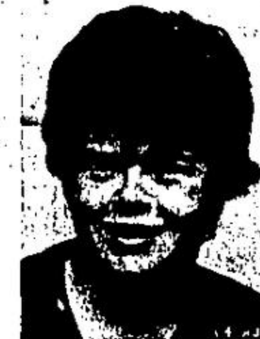
By Pat McLeod