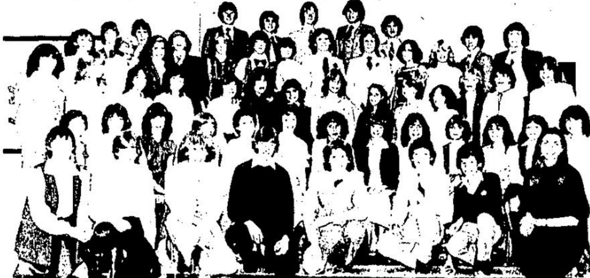
The Georgetown and District High School Rebels Athletic Association cross country championship at the Boyd Conservation Area east of Brampton.