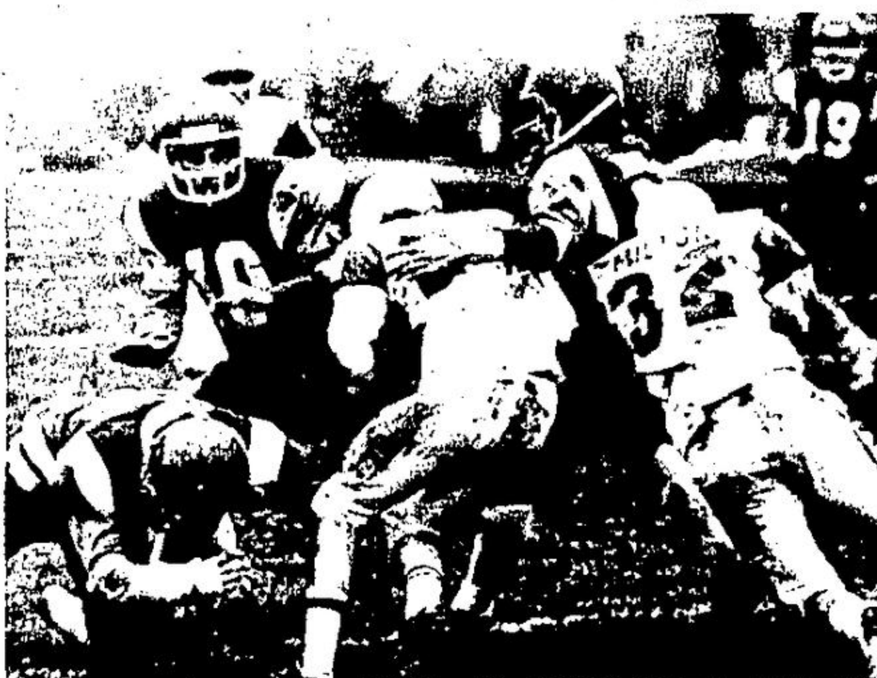
The Georgetown District High School junior football Rebels finished off their football season in fine style by defeating their Milton rivals 27-0 in an exhibition contest. Good defence and teamwork on tackles, such as seen above, led to their victory last Thursday afternoon on home field.