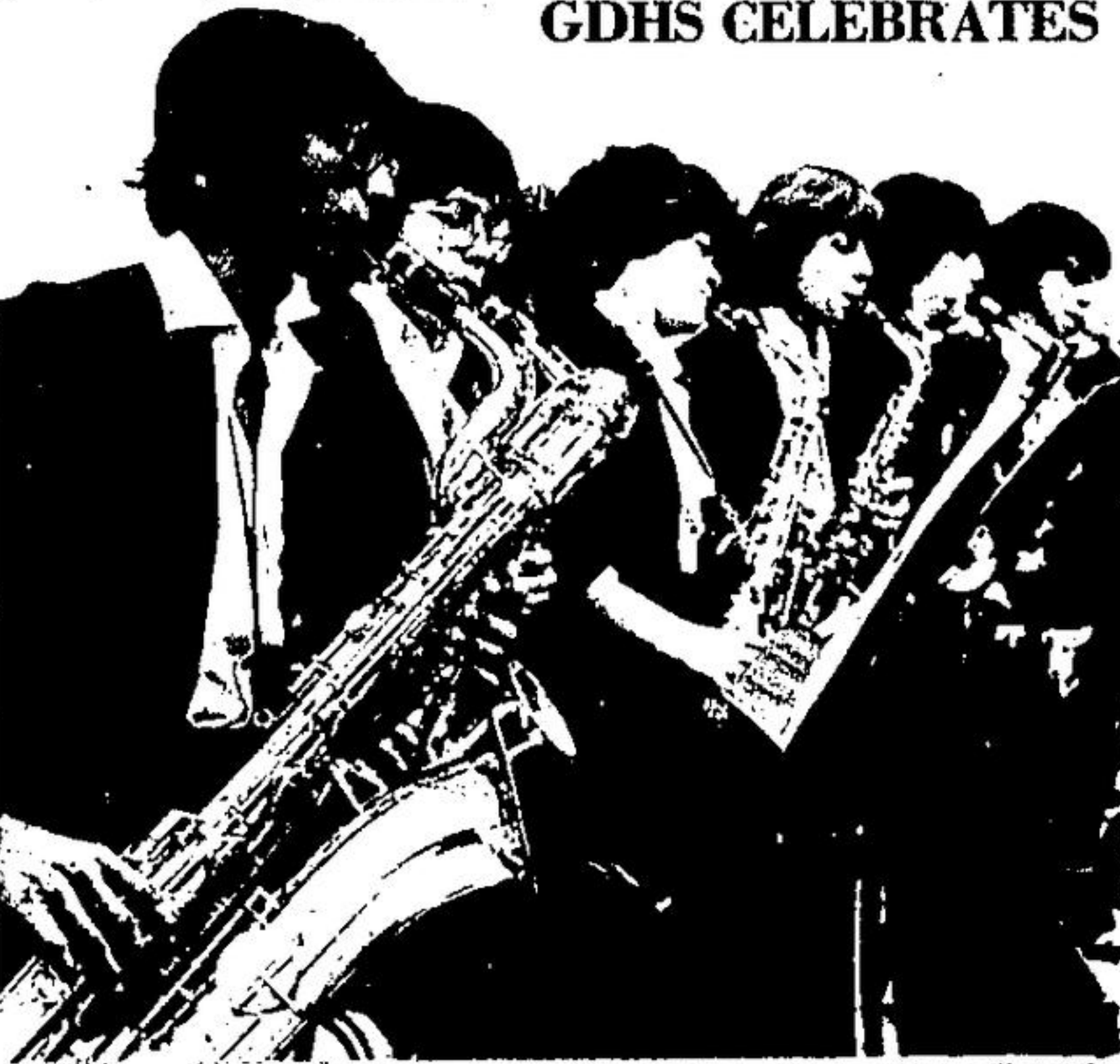
In top form as usual, the Georgetown and District High School band got things rolling at the high school's commencement exercises Saturday and made sure the pace never lagged. This shot of the saxophone section shows what the band is most recently blowing its own horn about: spanking new, deep blue band sweaters.