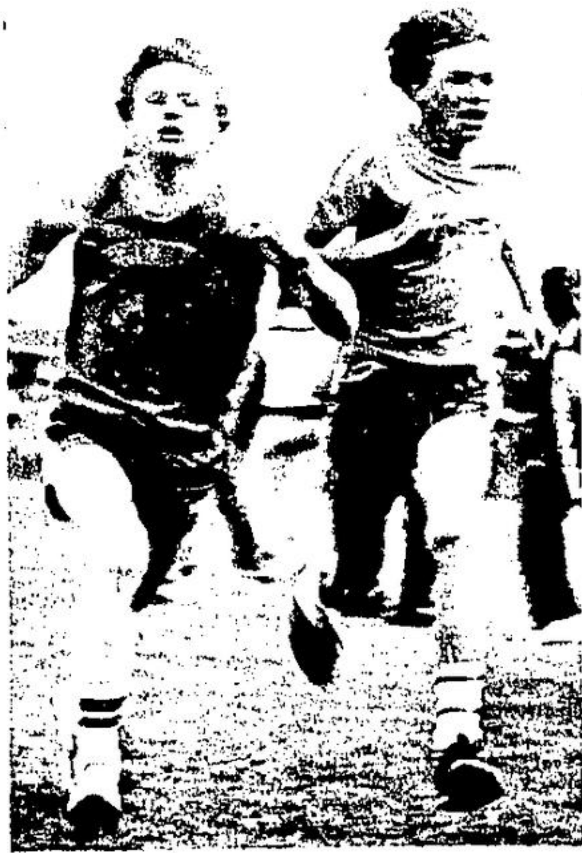
Charging towards the finish line were runners from Centennial and Stewarttown at the second annual Family of Schools cross-country run last Wednesday.

Last Friday (Oct. 9) Centennial senior public school competed in a cross-country meet in which everyone in the school participated.