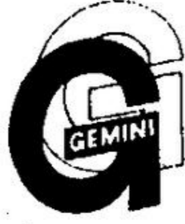
Against Dixie, Georgetown