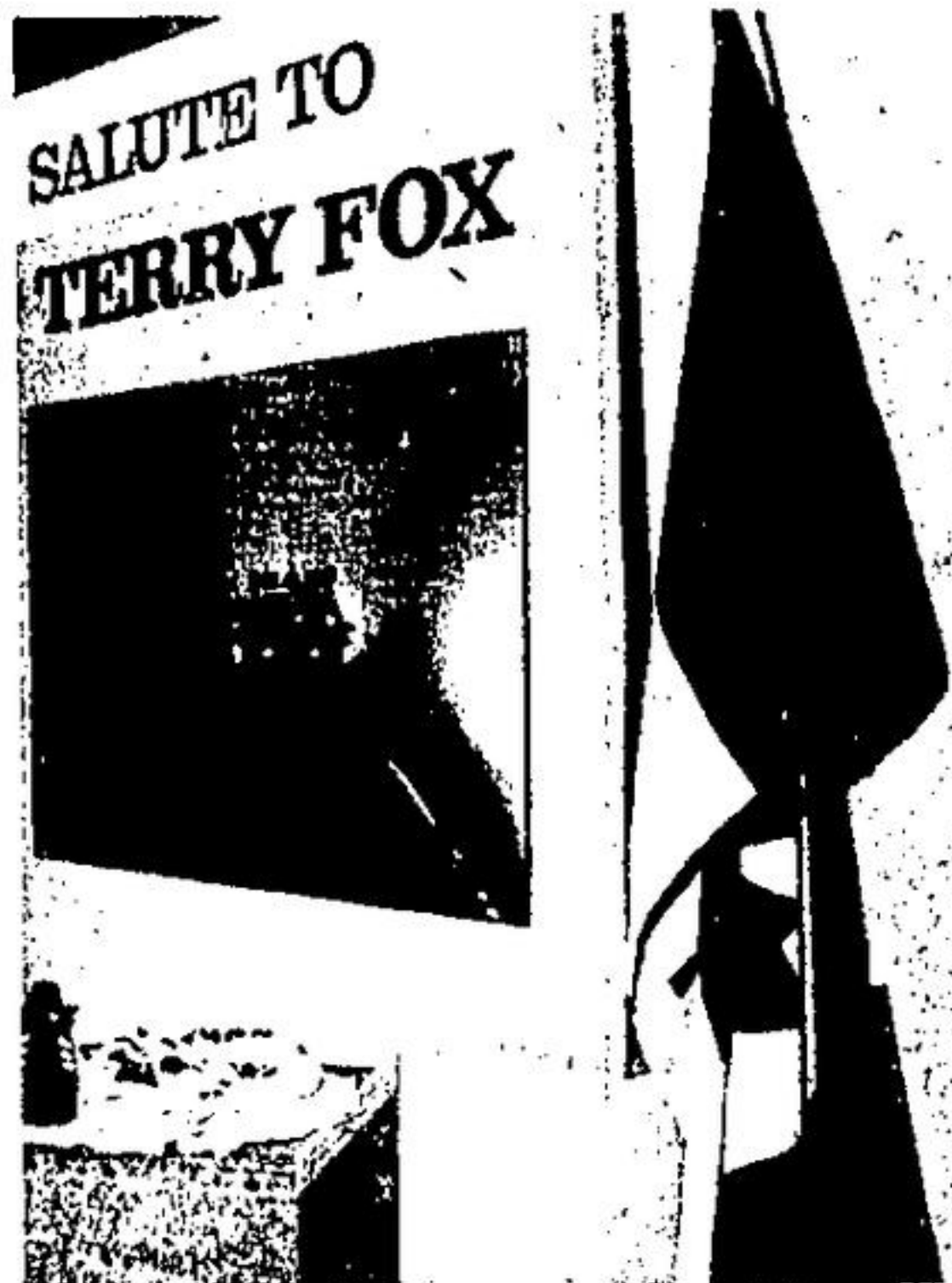
Visitors to the Canadian National Exhibition this year had a chance to see the Terry Fox Exhibit, a collection of photographs and other mementoes from 1980's Marathon of Hope. Now, the Canadian Cancer Society and the Armed Forces are pooling efforts to share the exhibit with European admirers of the young cancer victim. The exhibit travels to Belgium for an early November showing at an Armed Forces reception.

Finally, while TV's comic Odd Couple once had this trouble with a vindictive landlord, it is illegal for anyone to cut off heat or hydro as a method of extracting rent payment or settling other accounts in the rental agreement.