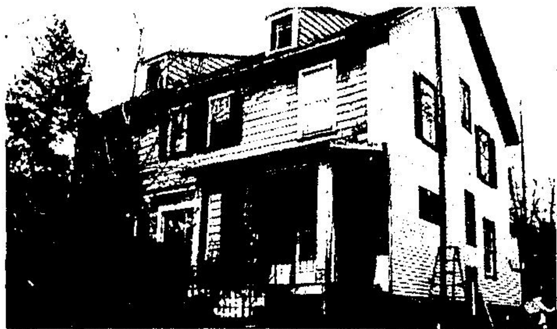
ALUMINUM SIDING CAN DRASTICALLY CHANGE the style of a house, where desired. On this 50-year old residence, the new gold color aluminum siding already installed on the side stands out in sharp contrast to the old, peeling clapboard on the front of the house. When remodeling is completed, brown aluminum trim will contrast effectively with the light color siding and add further interest to the renovated house.

Look for one who will take the time to study your house and offer some innovative ideas, even if you don't want to go along with all of them. It generally indicates that he knows his business.