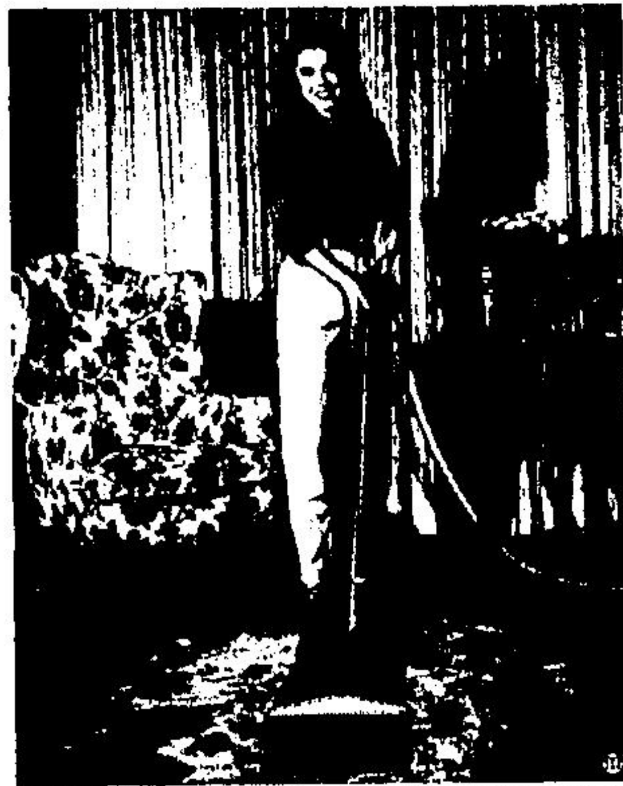
EVEN A CLEAN RUG is a trap for holding mustiness, smoke and pet odors. If you sprinkle a little "Love My Carpet"™ on your carpet when you vacuum you'll find that all of those odors are easily overcome.

Available in Regular, Citrus and Floral scents, this is an easy way to keep your whole house smelling fresh and clean. It's a nice finishing touch.