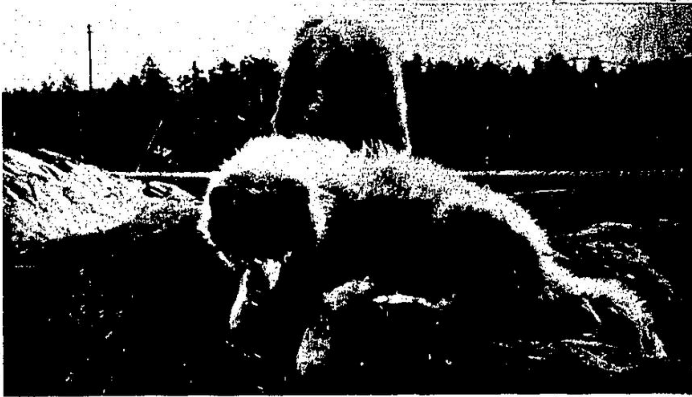
The Eskimo dog was close to extinction in the 1970s when the Eskimo Dog Research Foundation took over and saved the race. These beautiful working dogs are bred at Yellowknife, in the Northwest Territories.

production of a pedigreed line of Eskimo dogs. Also extremely important, according to Bill Carpenter, is the already successful program of providing, free of charge, breeding stock or teams of dogs to the native people of the Northwest Territories who need them in order to return to their traditional lifestyle. For general information on Canadian vacations, contact the Canadian Government Office of Tourism, Ottawa, K1A 0H6, Canada. Install low hooks, rods, drawers or open shelving to encourage children to put away their own clothes.