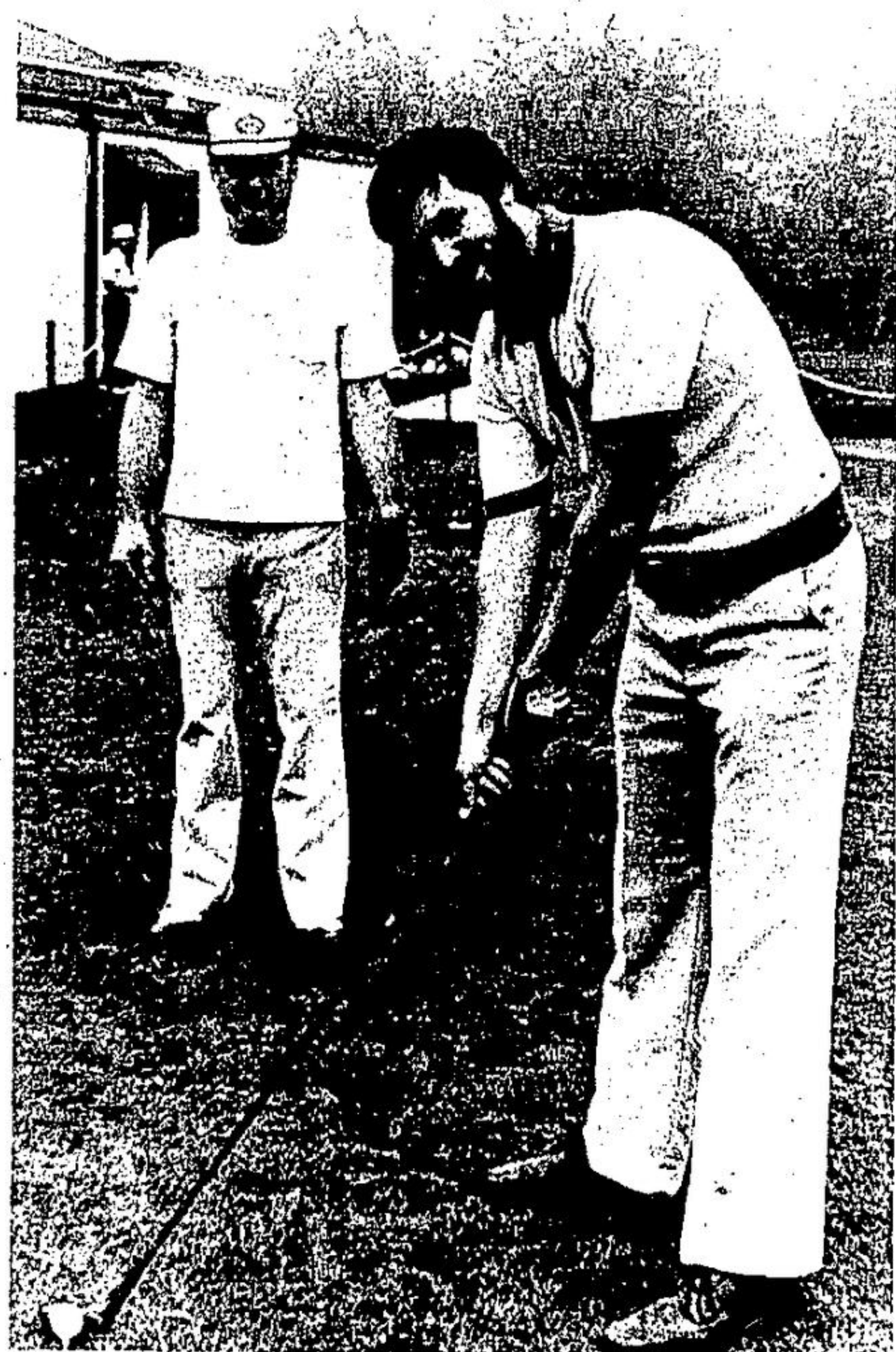
TEE FOR TWO