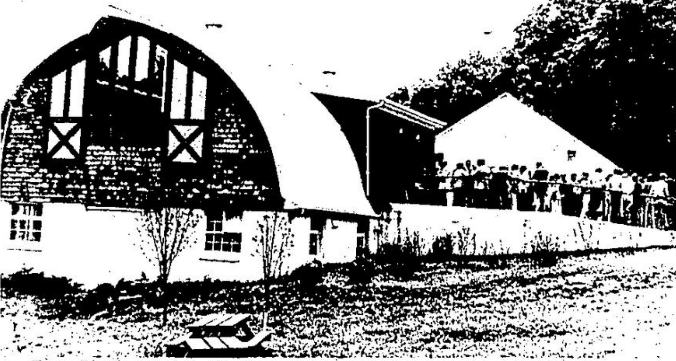
The new Education Centre in the Silver Creek Conservation Area was actually once a horse barn, but after renovations has been converted into a teaching area. It was formally opened Monday afternoon.