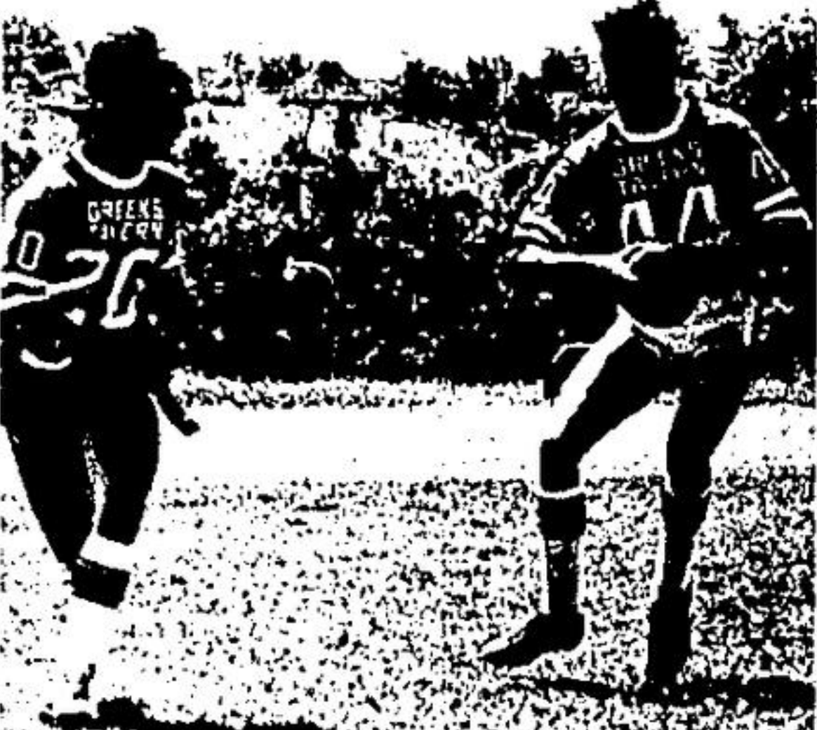
The Greeks backfield attempt quarterback option in recent flag football action.