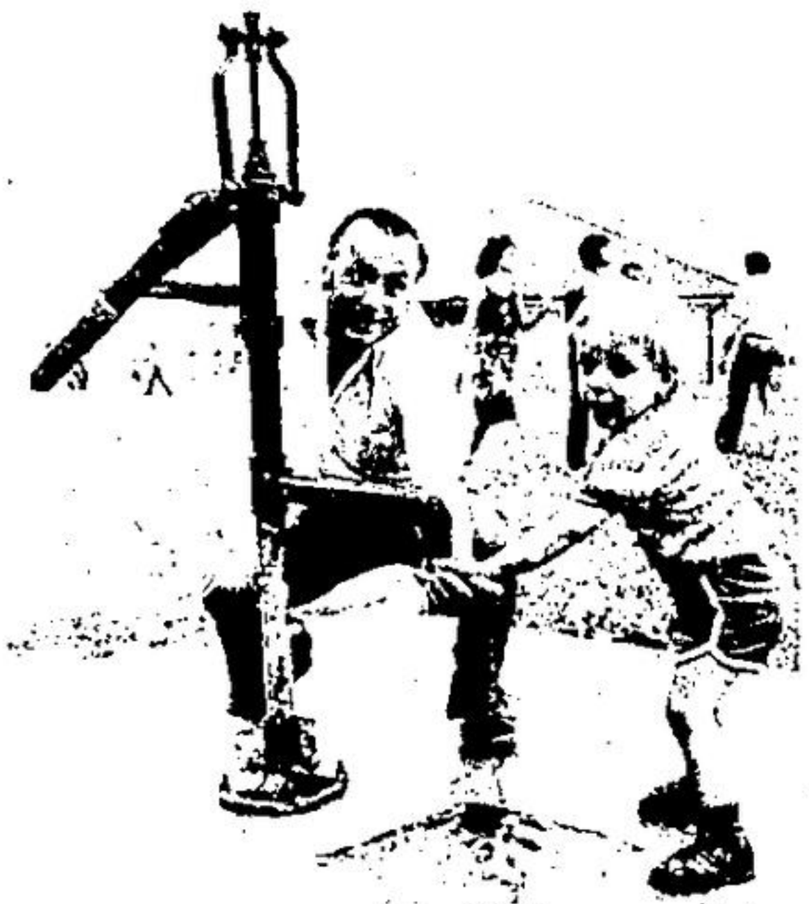
Small as it was, this old pump on the farm now occupied by the Croatian centre, proved a popular distraction for younger Feast of St. Anthony celebrants. Here, a gentleman helps his grandson to a drink during festivities Sunday.