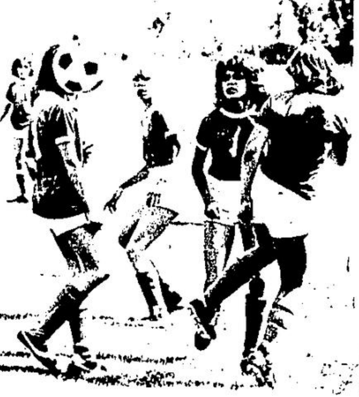
Playing "heads-up" soccer are the Mosquito 'Invaders' and the 'Spikes' as they fight for possession in recent game action.