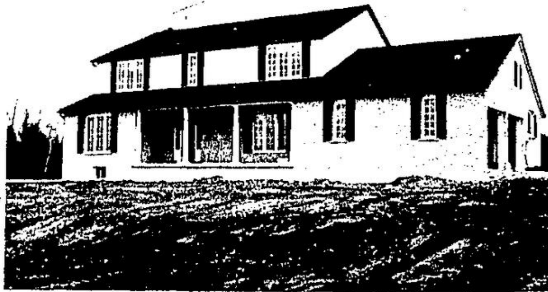
Although landscaping has not yet been completed on this relatively new home, you can see from this view the quality construction of this executive home on 50 acres south of Rockwood.