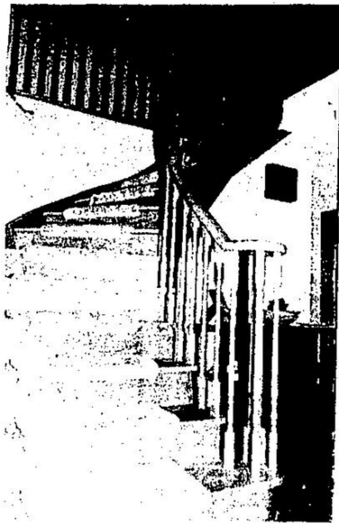
An attractive view of the curving, hardwood staircase, which leads to the 4 bedrooms on the second floor.