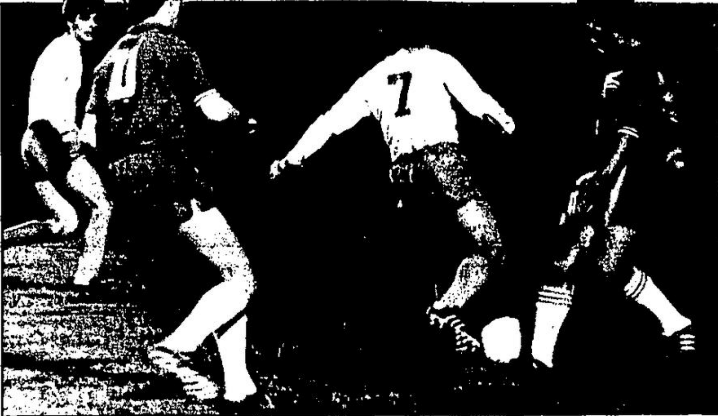
The senior Falcons soccer club of Georgetown battled it out with Neerlandia of Mississauga but were defeated 1-0 in a goal late in the game last Monday. The Falcons start