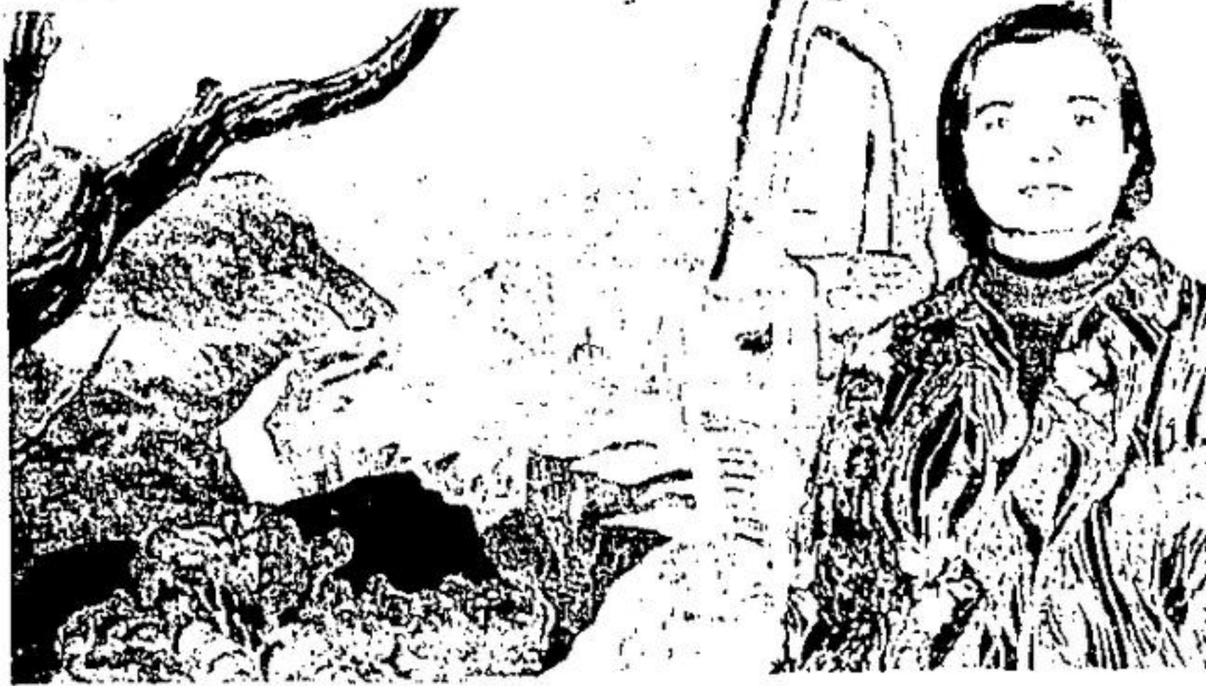
Frieda Nelson's latest exhibition at Georgetown's Gallery House Sol, continuing until May 14, is a pictorial travelogue of her tour of the western U.S. The beautiful Western View Number 7 in acrylic sells for $1,500.