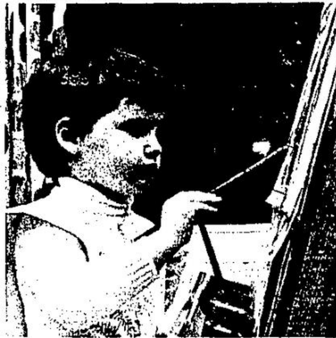
ST. JOHN'S ARTIST

A Halton Hills Fire Department report concerning a Rexway Drive fire March 24 gave the incorrect address and was reported as such in The Herald's Weekend Extra Friday. The fire occurred at 167 Rexway, not 169 as reported. The error appears to have stemmed from the fact that the firefighters were summoned from the phone at 169 Rexway. The Herald regrets any embarrassment caused for either homeowner.