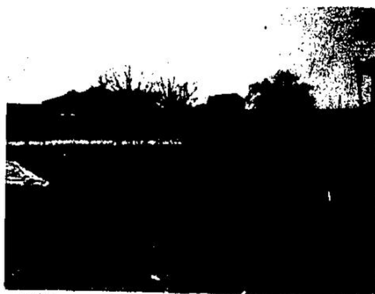
Which are you fond of? Strawberries, raspberries, apples, pears or cherries. No matter which it is, you can pick it fresh in your own yard.