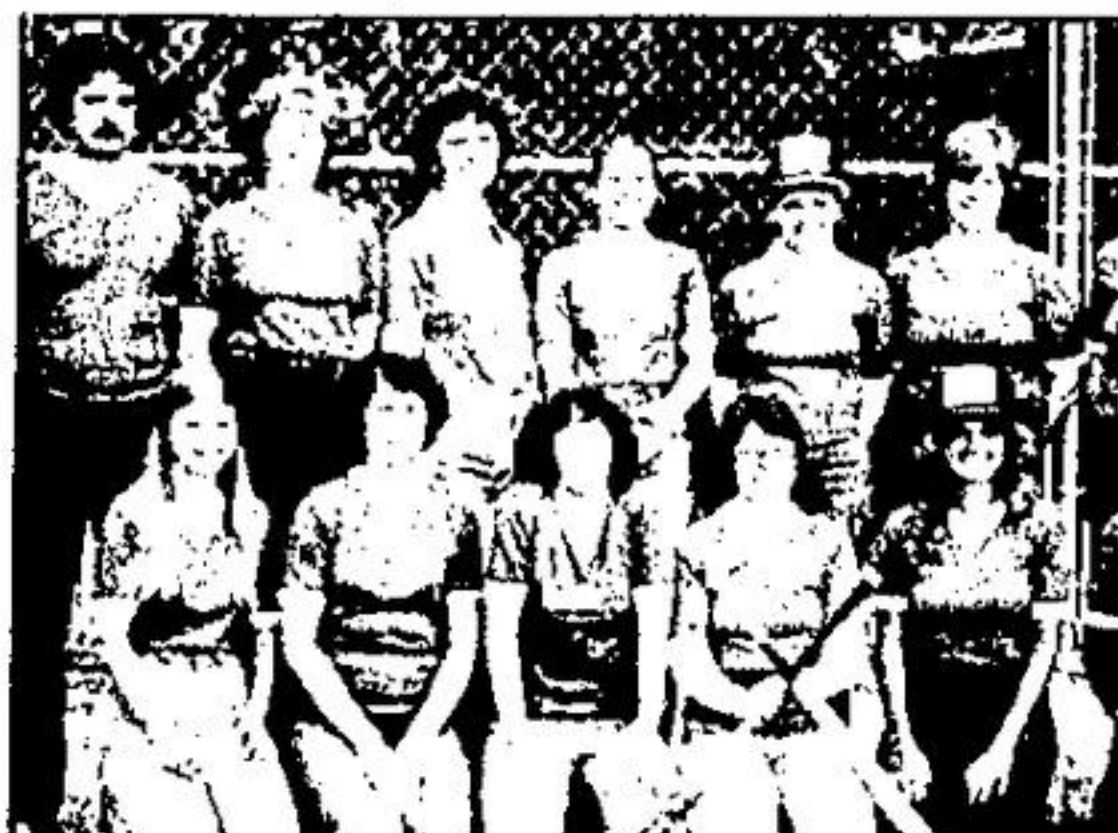
The Orange 'Orioles' of the Powder Puff ladies softball league didn't reach the finals in last season's play, but they had a lot of fun over the season.