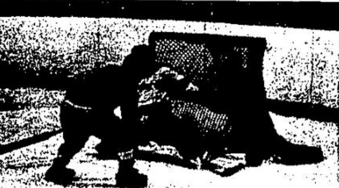
RAIDERS! The Georgetown Raiders looked impressive in their 9-6 and 7-2 win against the Greys over the weekend. With last night's game completed, the Raiders could possibly not play again at home until April versus Thunder Bay.