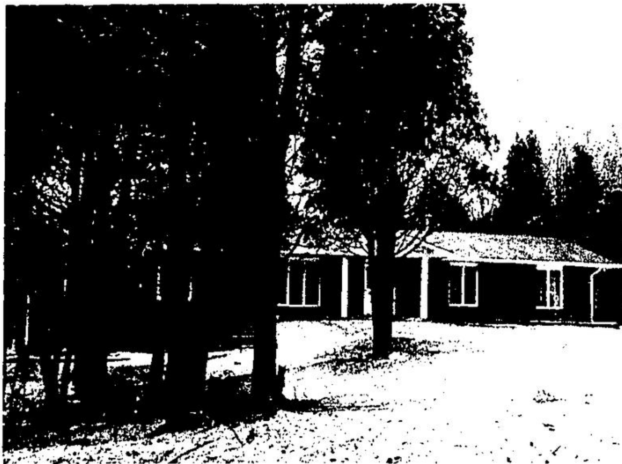
This fine country estate home in Erin Township is viewed from the drive. Fifteen of its twenty-five acres has been reforested with pine trees. Also included in