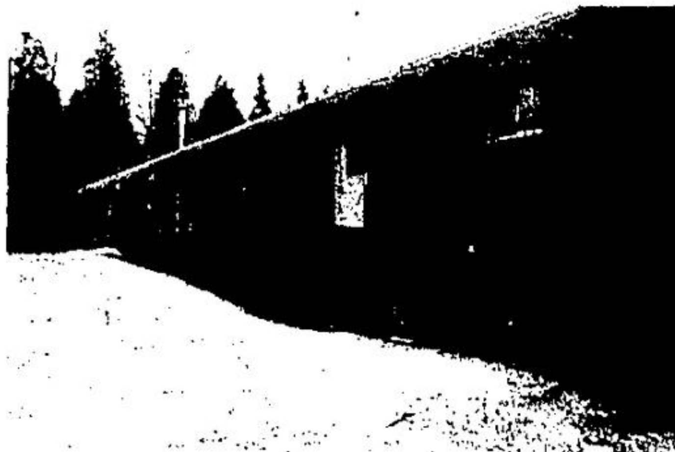
The view from the back of this secluded home shows a large deck with a great view of the woods. A terrific place to catch the morning sun in the good weather ahead!