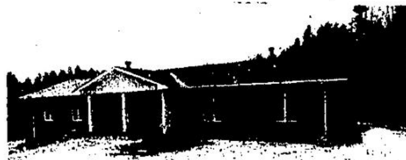
Long, low and lovely best describes this all brick bungalow. The built-in garage is on the far end to the home, and is large enough for 2 cars and a workshop.