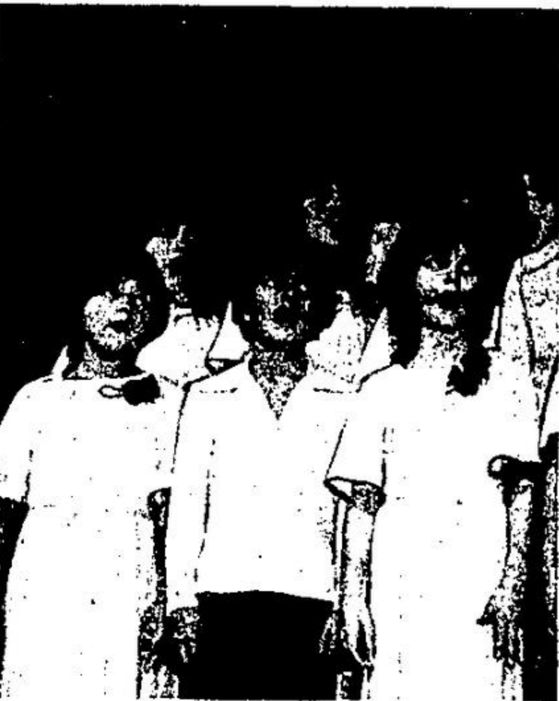
The Ottawa-based vocal and instrumental group Les Tournesols put on an impressive show at Sacre Coeur Church hall in Georgetown Sunday afternoon, combining 75 young talents who've enjoyed extensive performing experience around the province during the past six years.