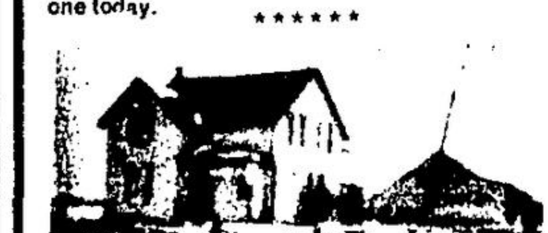
10 ACRES - ROCKWOOD - HUGE BARN

$39,900 with good mortgage at 10 3/4%. Immaculate semi in Acton - 3 bedrooms, private drive & garage. Close to all facilities. See this one today. *****