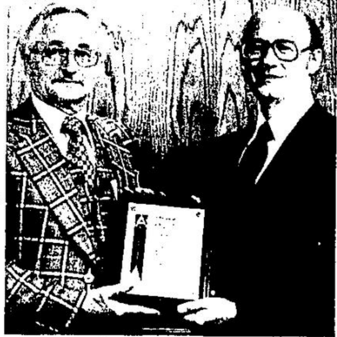
ALLISON DEALER TOPS