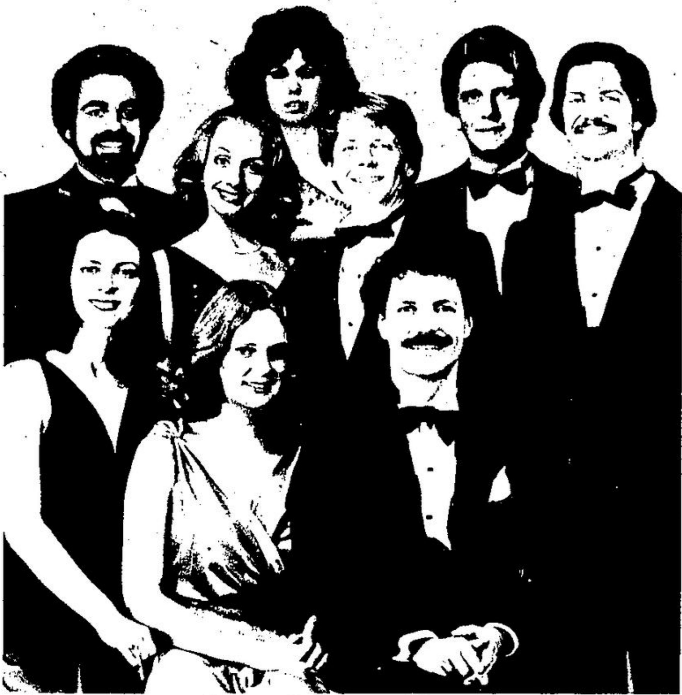
Toronto's Tapestry Singers

Arts Council's Trilight returns next week