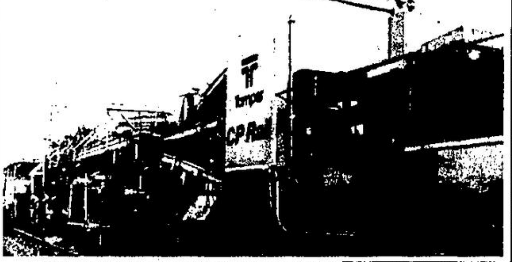
CP's rail changecut machine lifts out the old rail and lays, levels and aligns new track along GO's new Toronto-Milton commuter corridor.

The 50-kilometre commuter route will be GO's fourth rail line and will have seven stations, with Union Station as the terminal point in Toronto. The stations are: Milton, Meadowville, Streetsville, Erindale, Cooksville, Dixie and Kipling.