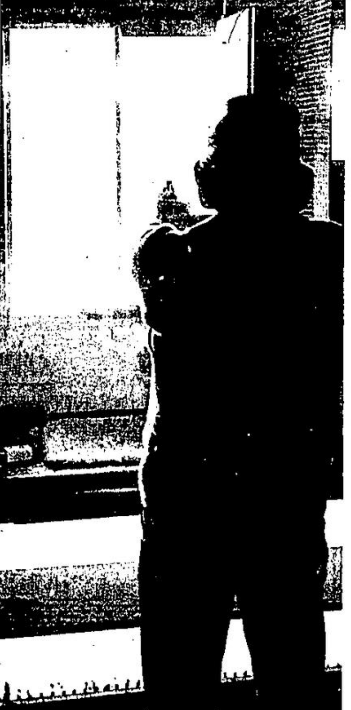
Shooters using the handgun range at the Peel Game Farm in Brampton can shoot from the comfort of the Peel Hand Gun Club's enclosed shed which faces the range. But not anyone can throw a pistol into the trunk of their car and drop by for a little target practice. Federal regulations and club rules insist that prospective members join the club, take its courses and prove their proficiency at the sport before they can even transport their own guns to the range.