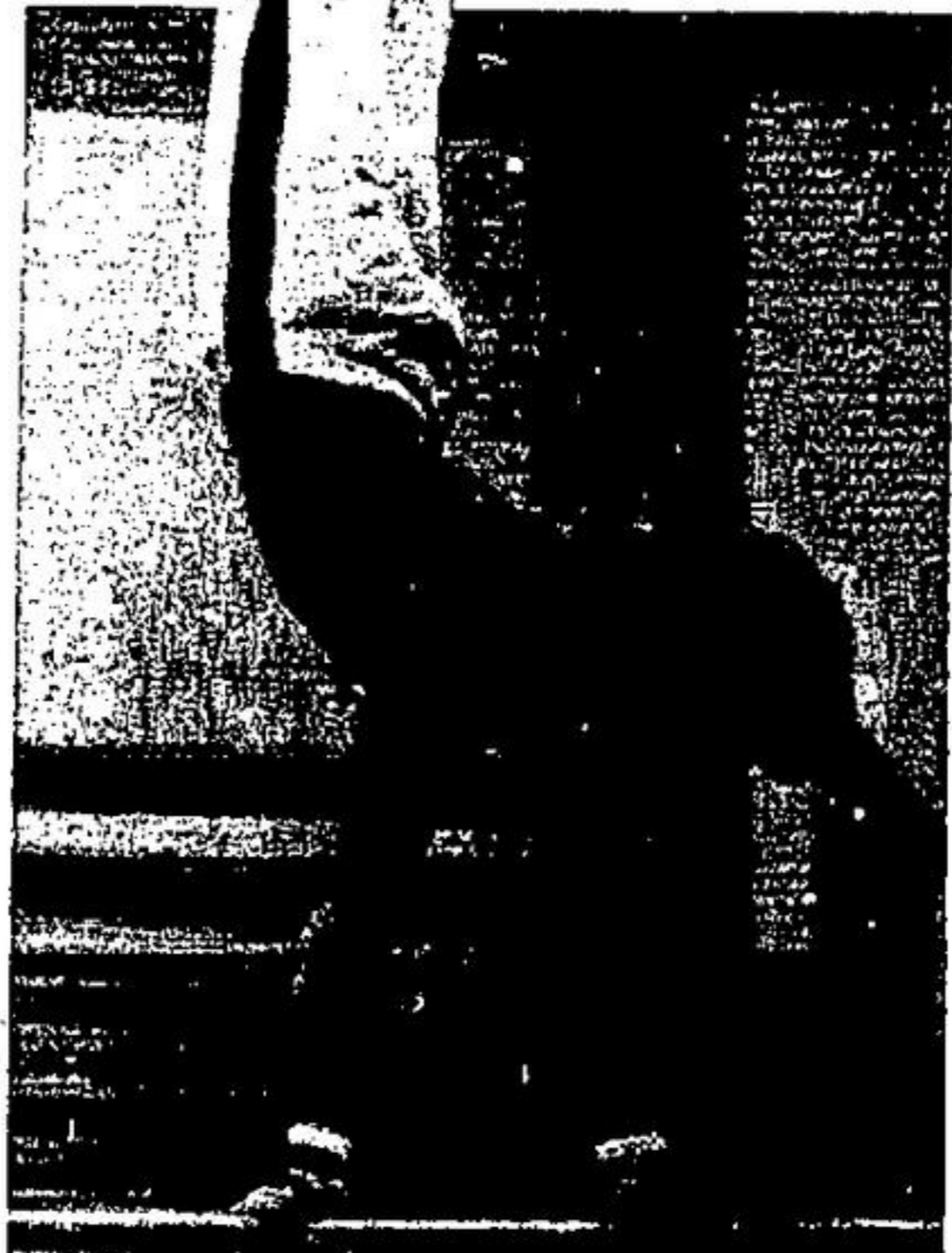
One of the senior members of the Georgetown High school shows good form on the high bar.

The gymnastics team, although they have been practising since early October, do not have their first meet until the middle of February when they will go up against a high school team from Grimsby. They also play Highlands high school in Dundas which should be a big meet for the students, the coach says.