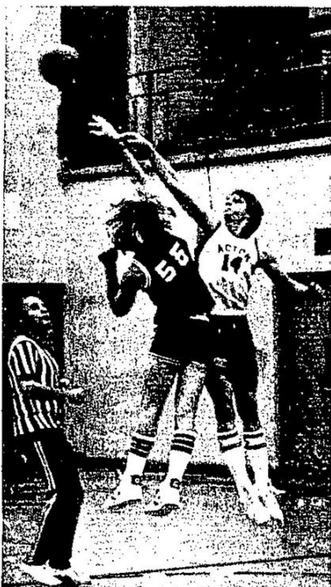
Acton and Georgetown paired off in a triple header at the Georgetown gym last Friday afternoon. Here, two of the players for the senior boys game reach for a jump ball during the afternoon's action.

The above successful winners will bowl representing the Georgetown Bowlers Association on Jan. 17, 1981 at the provincial finals for the right to represent Ontario at the National Championships.