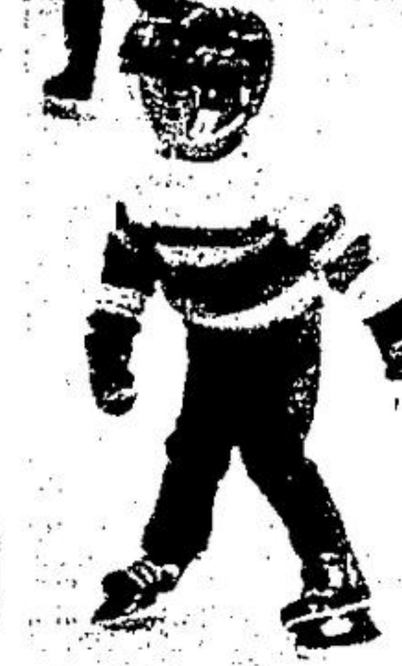
Figure skating is in full swing at the Memorial and Alcott arena, and kids of all ages are busy on the ice working towards skating badges. With the help of seven professional helpers, amateur helpers and volunteer parents, children as young as four years old can start working on badges that are part of national skating tests.

The Beginners Test requirements consist of 1) skating the width of the rink without falling, 2) Forward skating and glide on two feet across the width of the rink, 3) Forward skating and glide on two feet then bending knees grasp outside ankles returning to a standing glide position, 4) Stopping - any skid stop (e.g. snowplow, side stop). When the skaters pass ten badges, they are ready to advance to more difficult figures and oftentimes will compete at this stage.