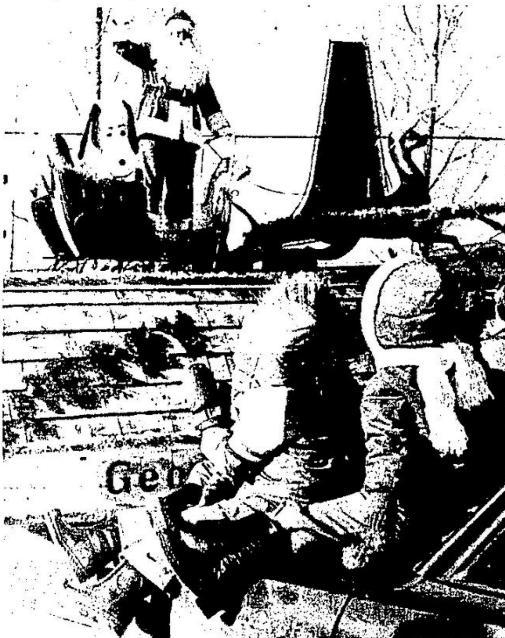
Christmas wishes are exchanged well in advance of the holiday, as these three children wave to St. Nick as Saturday's Santa Claus parade passed along Maple Avenue on its way to the Georgetown Marketplace—its final destination. Saturday's fine, warm weather insured a good turn-out for the event, sponsored for the past 50 years by the Georgetown Lions club.