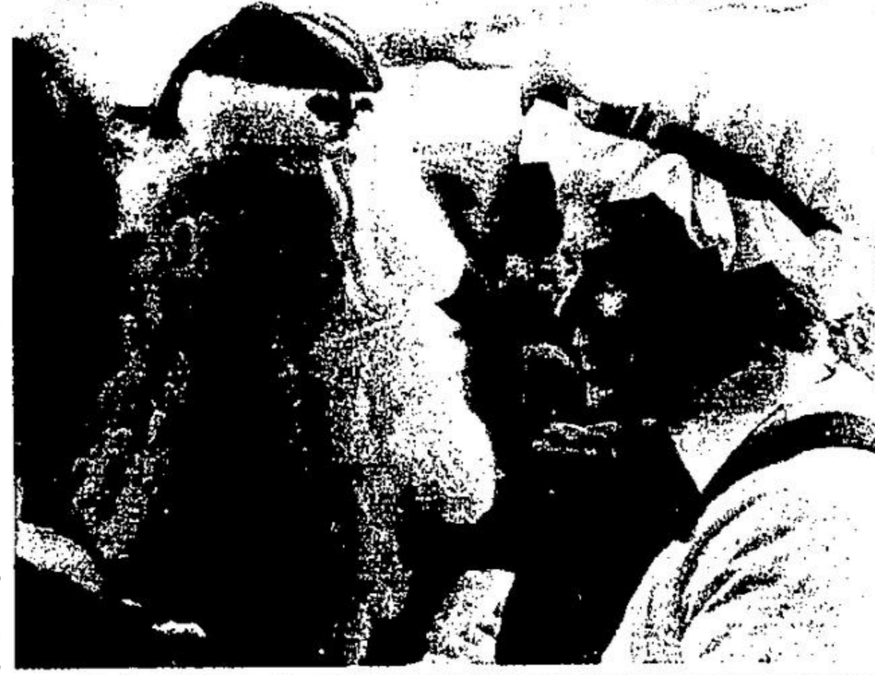
Awaiting at Zeller's, Mrs. Claus was ready for her "husband" as he arrived at the store following his lengthy tour through Georgetown in the Santa Claus parade. Inside, youngsters were eager to tell him their seasonal gift requests.