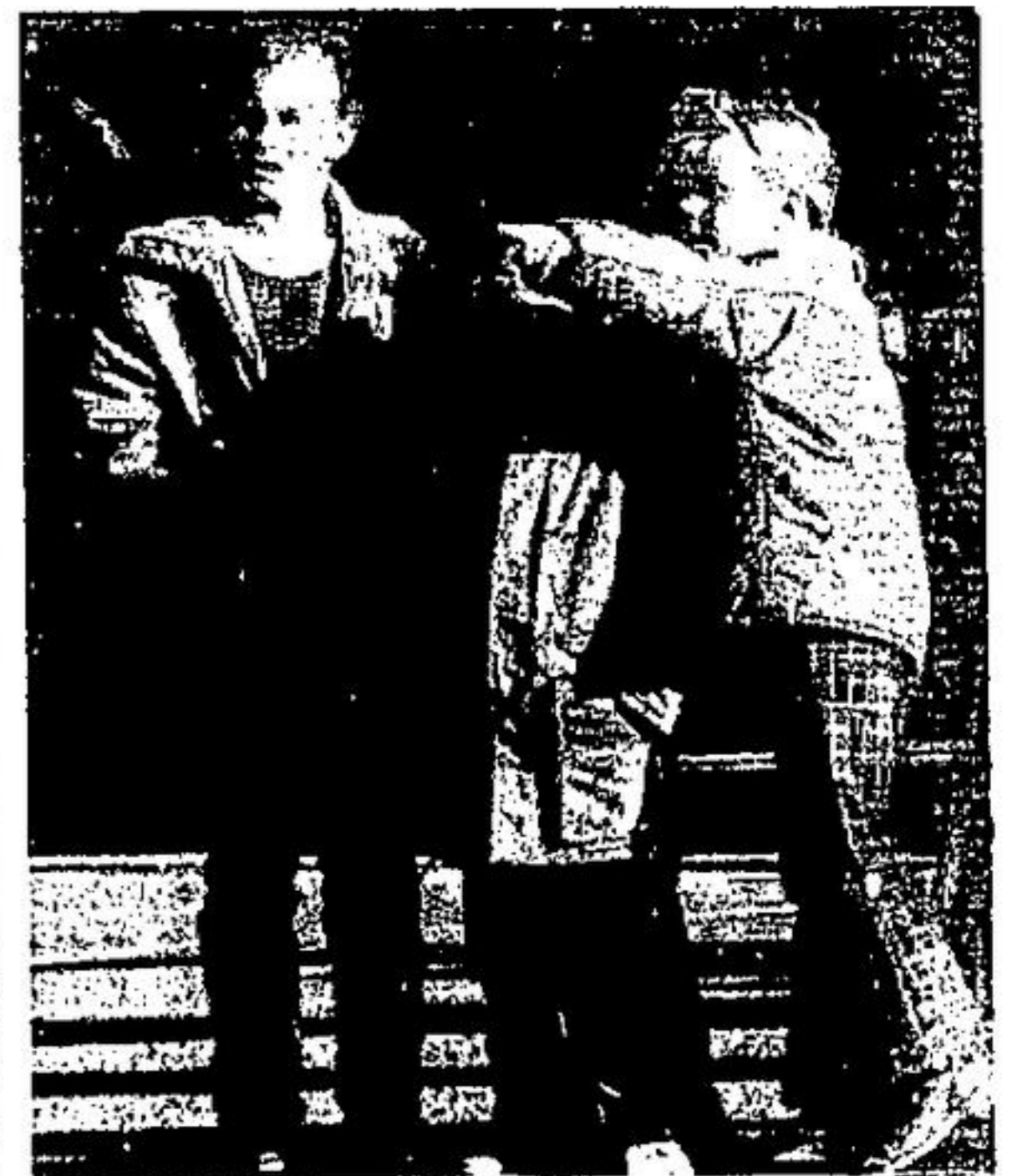
Here he comes! Everywhere you looked along Saturday's parade route, the delight was registered unmistakably upon the faces of youngsters awaiting Santa's arrival and having a grand old time in the meantime. The children downtown were no exception, hopping up from curbside seats to greet St. Nick with waves and cheers.