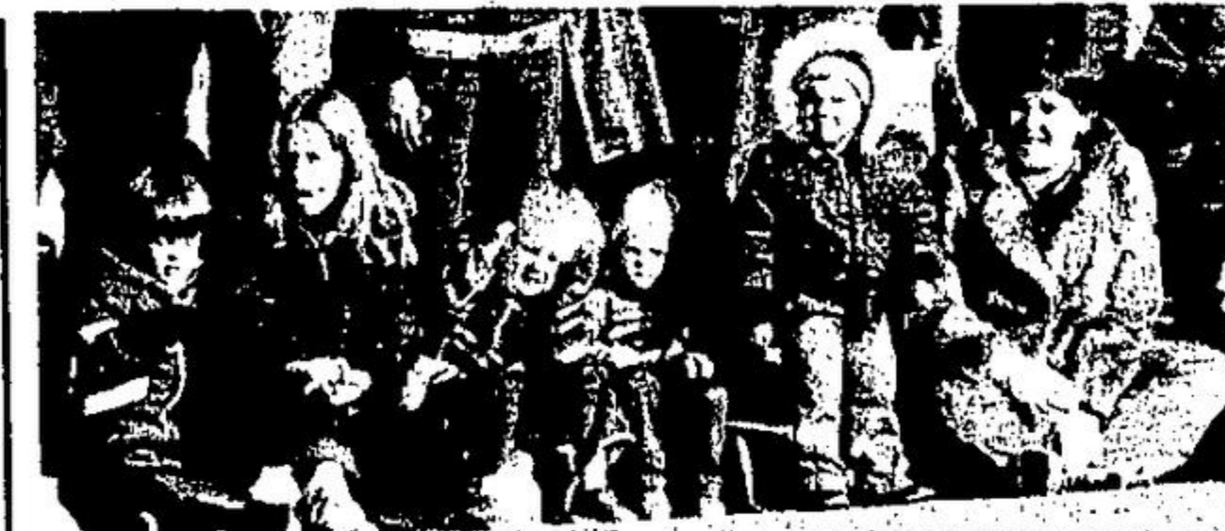
Plenty of clowns and other generous parade marchers kept young spectators well-stocked with candies as hundreds lined the parade route through Georgetown. For some, like one little girl in this photo, the noise of the bands was a little too much.