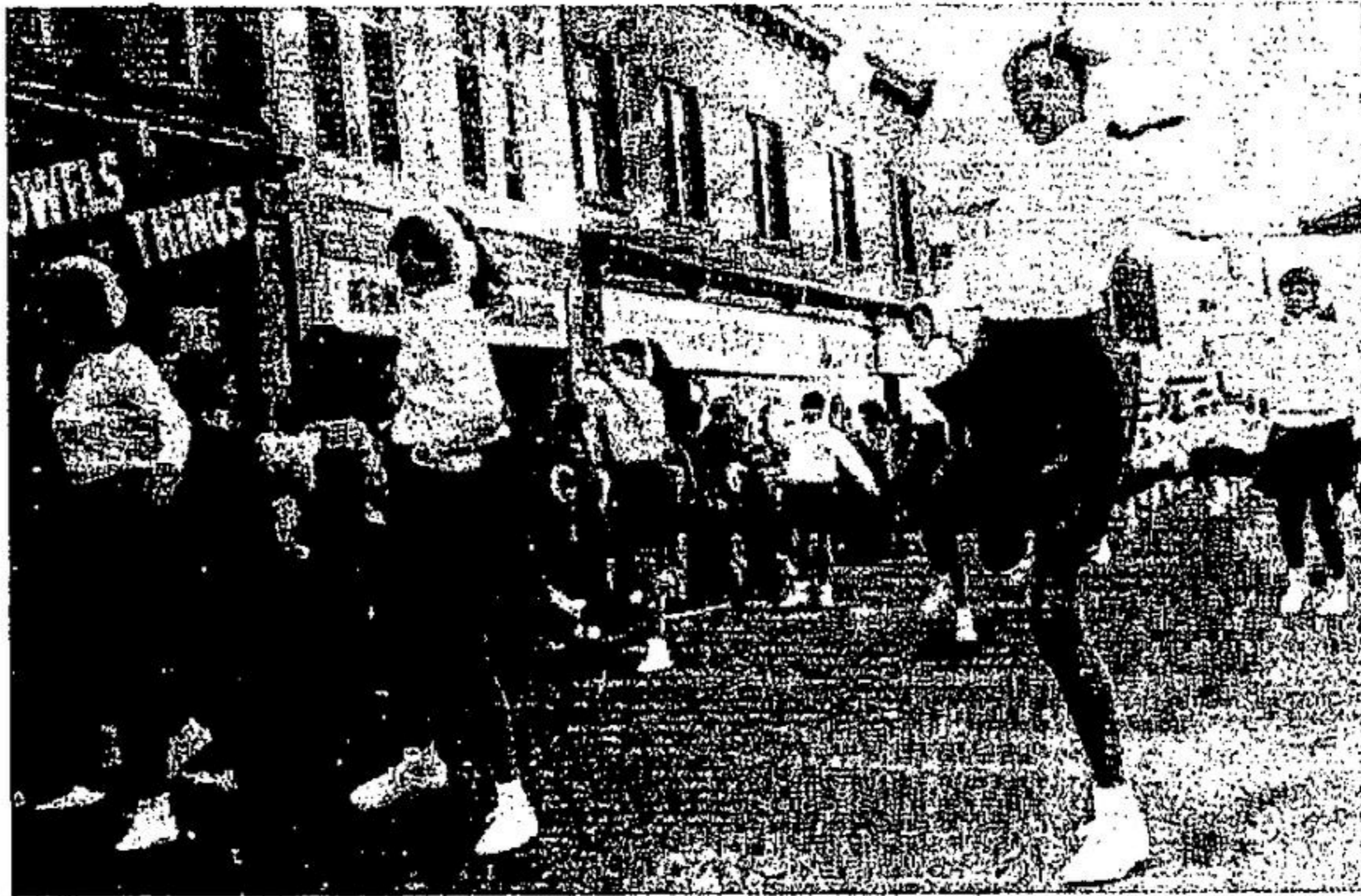
The Georgetown Elkettes marched through the community's Main Street business core during the Santa Claus parade Saturday. The Elkettes, until recently, were the Georgetown Majorettes but were taken over by the Halton Hills Elks lodge in a special ceremony three weeks ago.