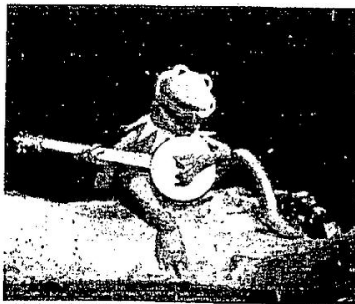
KERMIT THE FROG of the popular Muppets has been designated 1980 Chairman of the National UNICEF Day Hallowe'en Campaign. That's when, he explains, "people of all ages have fun helping the United Nations Children's Fund to make the lives of children in developing countries safer and happier."

Jim Henson, the creator of Kermit and all the Muppets, says that the effort for UNICEF is the first fund-raising campaign in which Kermit or any of his characters have been involved. But Kermit's and Jim Henson's concern and affection for children make them natural for the part.