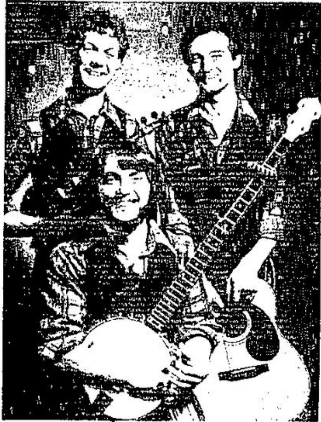
Folk group Maple Sugar