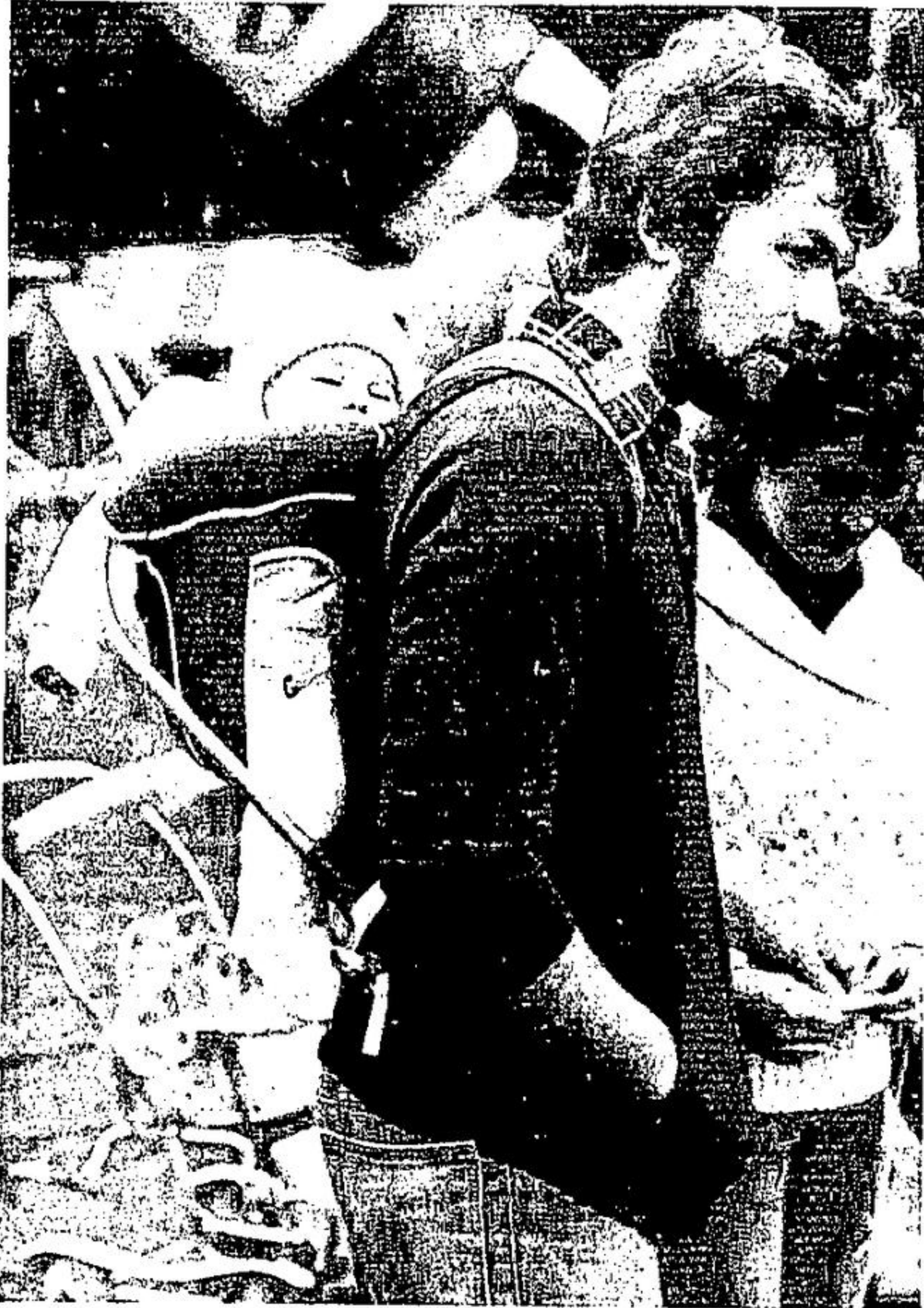
This young fellow seems a little less than thrilled with the goings-on at the fair. Fortunately, Dad's shoulder was handy to provide a little cushioning for a nap. Just for a second...