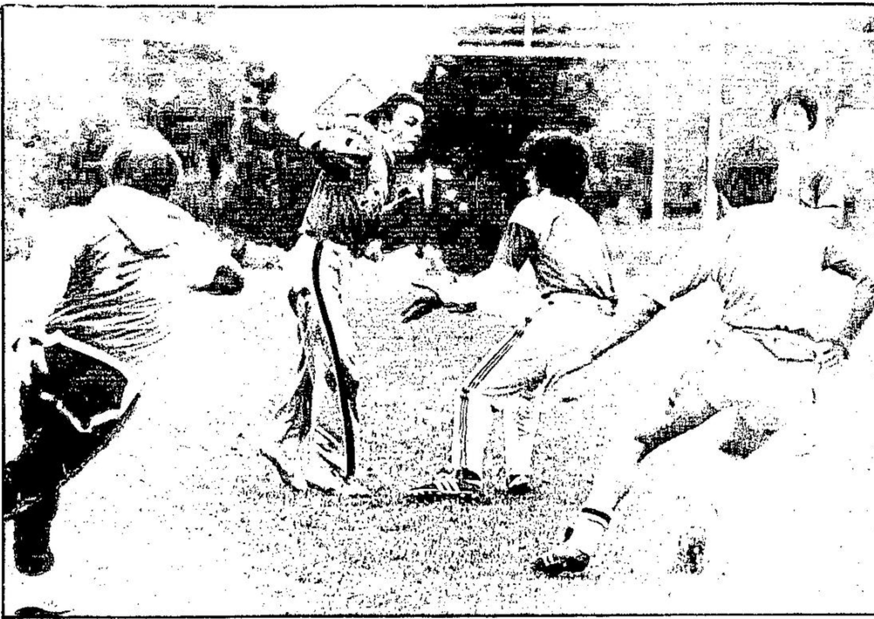
Dave's BP players move in and surround this Greek Tavern ball carrier Sunday morning in Georgetown Industrial Flag Football play. The Greeks eluded the clutches of their opponents long enough to come out a winner and one of the four teams left in the semi-finals set for a week this Sunday. Dave's BP were eliminated.

Next week a little on preparing your catch for freezing and a forward look to the ice fishing season. See you next week in ONTARIO OUTDOORS.