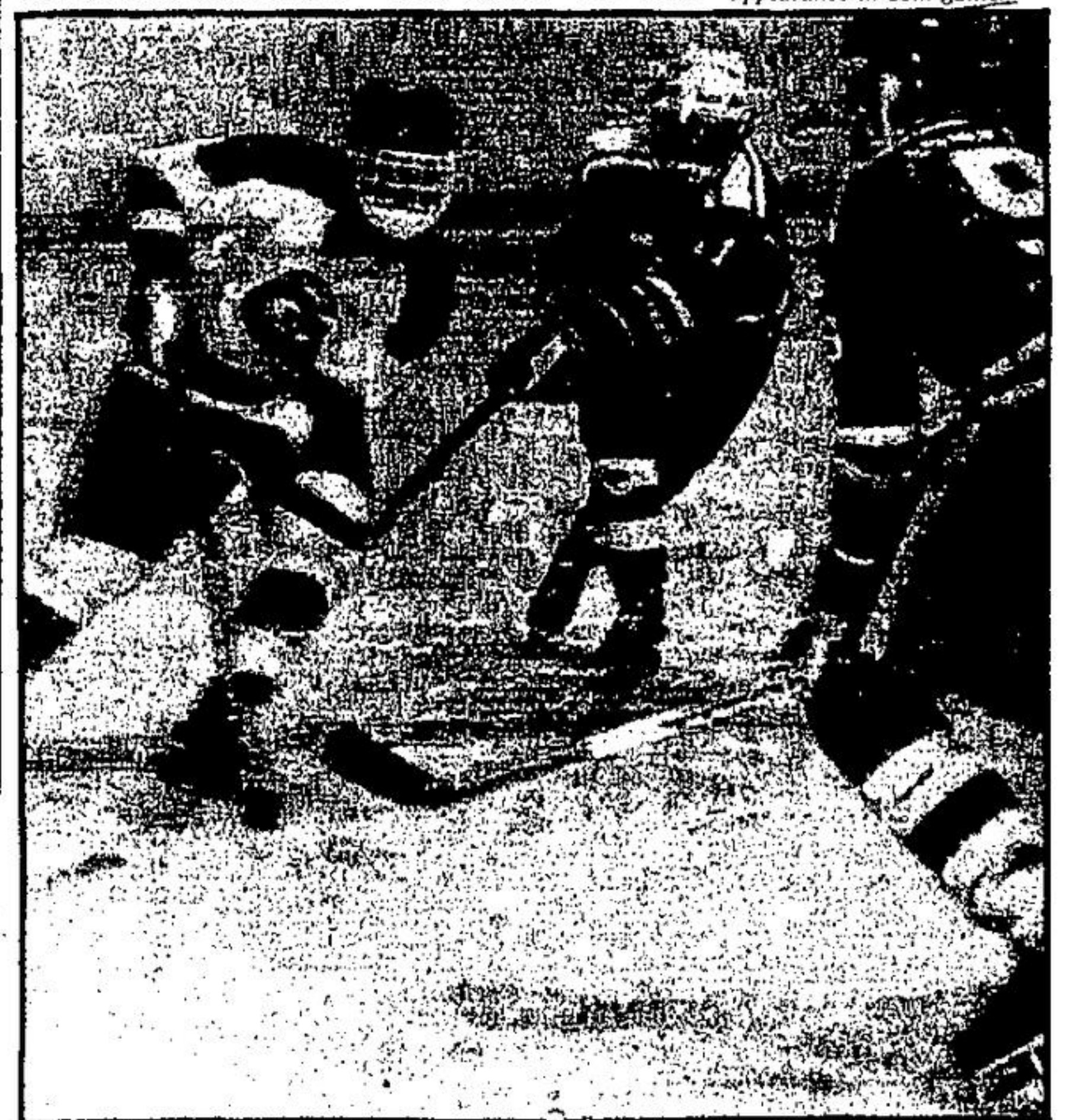
This mysterious Gem (the result of a new OHA rule forcing Jr. B players to wear face masks) passes the puck to a linemate Sunday night during the Gems' home opener at Gordon Alcott when two Oakville Blades move in on him. Georgetown lost their second game 7-2 but won their season opener Thursday against Dixie 6-2.

It has been six years since the senior team made it to the county finals at Hamilton's Ivor Wynne Stadium and a couple of further years back since the younger Rebels made it as far. This could be the year to change all that, or so the early season feelings indicate.