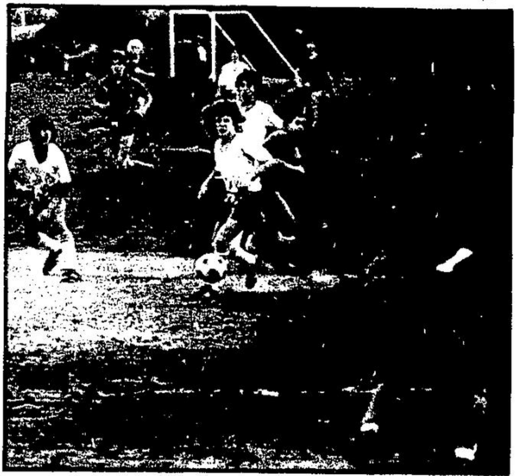
Look this way!