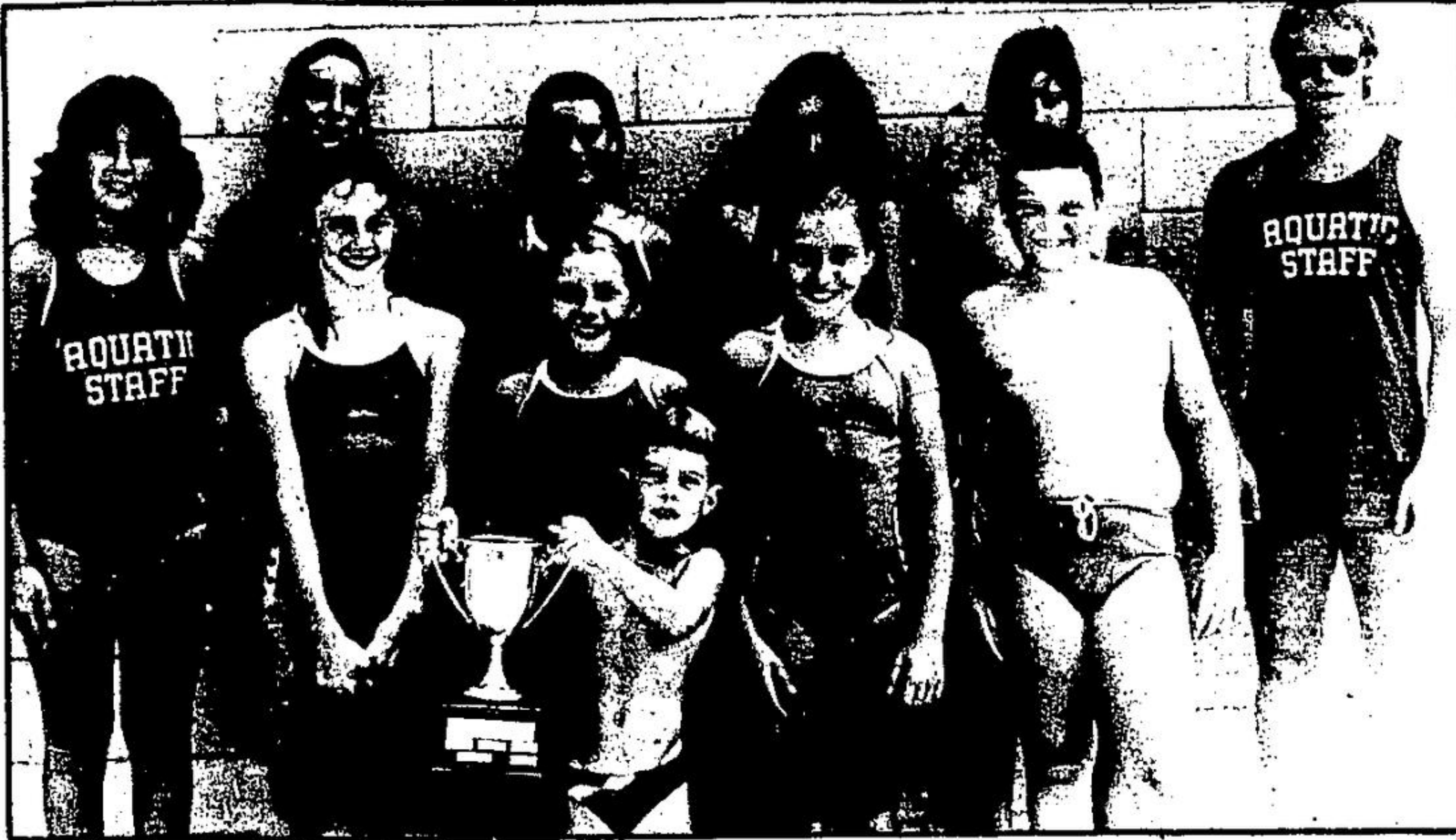
The Halton Hills Swim Team won the Kelly Cup at a swim meet in Ancaster August 21. The meet was so close, the score had to be tallied four times before the winner was finally announced. Not all of the 35 members of the team were able to be present for this photograph. Seen here with coaches