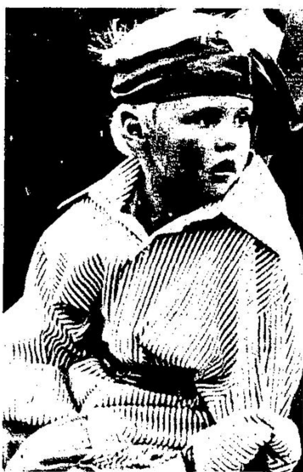
This little buccaneer seems to be contemplating his next battle with a certain amount of anxiety. Seeing the dragon at right, no one could blame him. Kids participating in the recreation and parks summer program's closing parade dressed in a variety of costumes, ranging from sealawags like the one above to everyone's favorite ogre, Darth Vader.