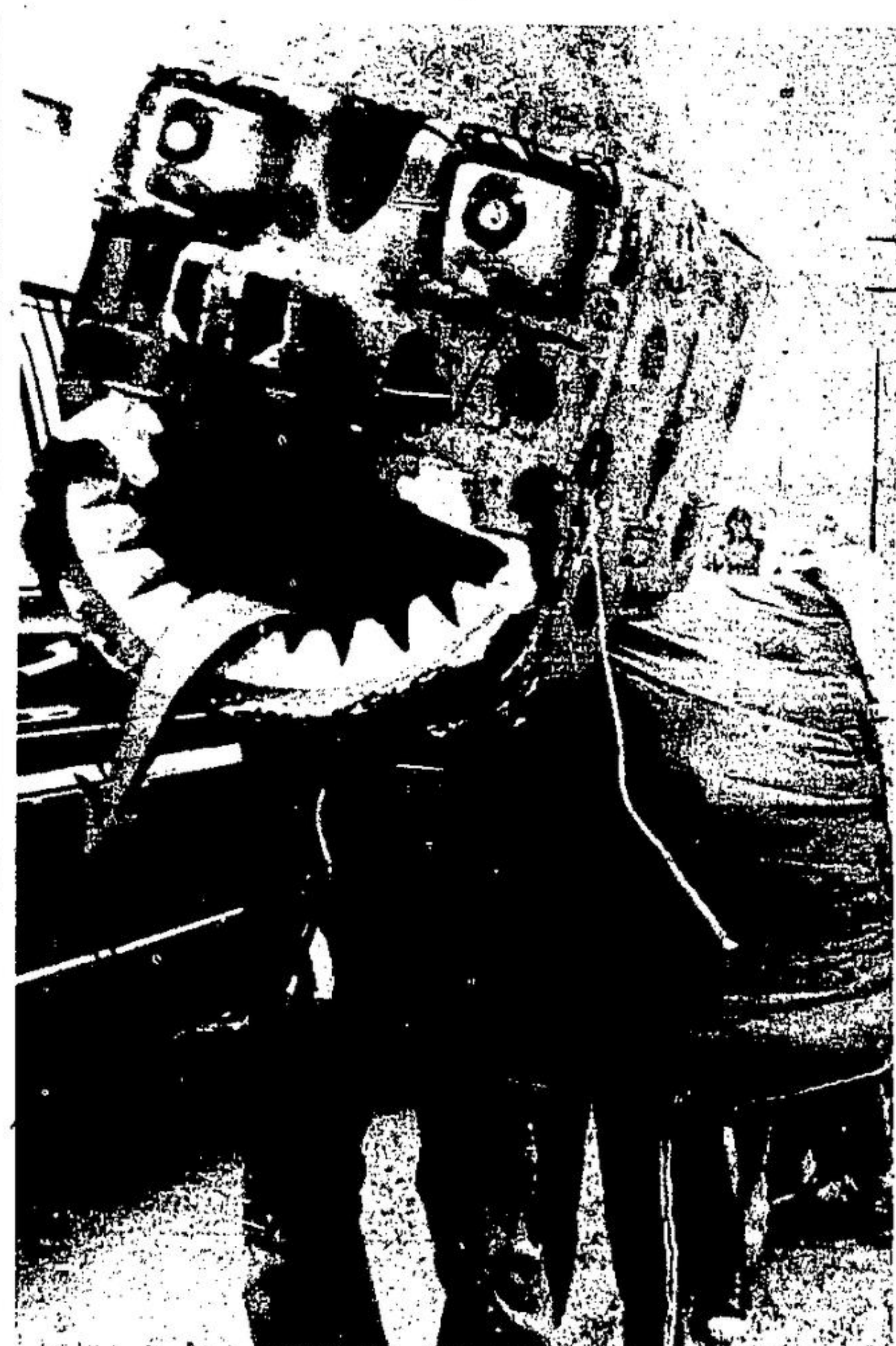
This savage-looking, sleeping-bag dragon coiled and skipped its multi-legged way through Acton Thursday night as kids and parents celebrated the end of another successful season of programs sponsored by the town recreation and parks department. The dragon was awarded first prize for the best float in the parade.