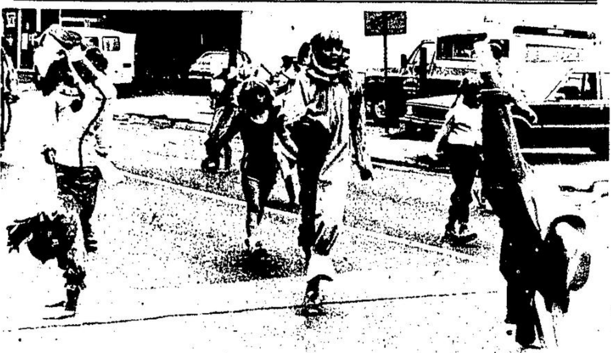
What's a parade without a little clowning around? Here youngsters cartwheel their way along Mill Street in Acton, following the recreation and parks department summer program parade to its grand and boisterous finale outside the Acton Community Centre. A carnival was held inside the arena following the parade.