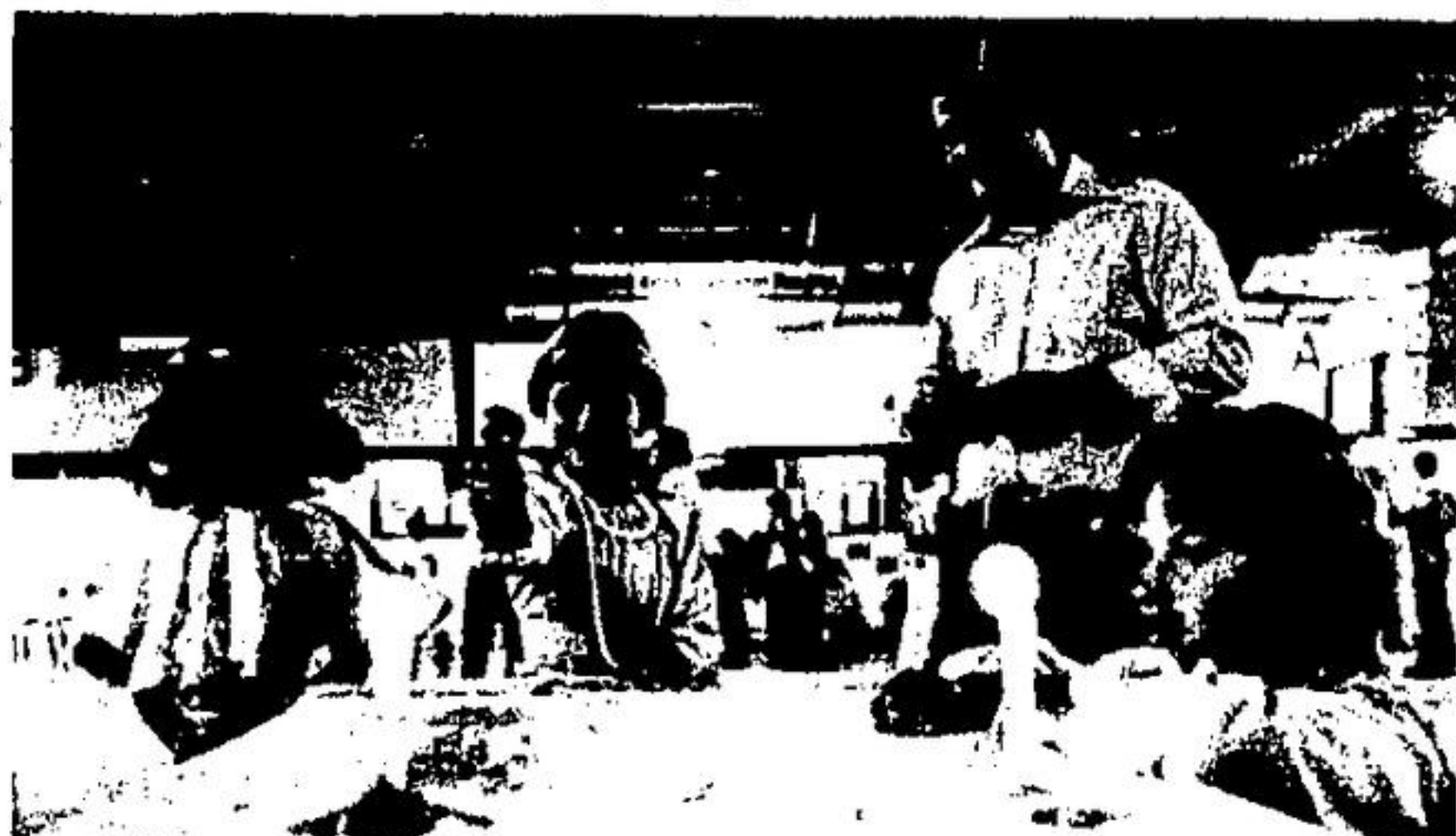
It's not as easy as it sounds, but the idea is to douse the flame of the candle using a water pistol at five paces. It takes a steady hand and loads of concentration, but this little girl finally snuffed out the flame to win her prize. The event was one of several games played Thursday in the Acton arena as the recreation department held a parade and arcade-carnival to close its summer program for 1980.