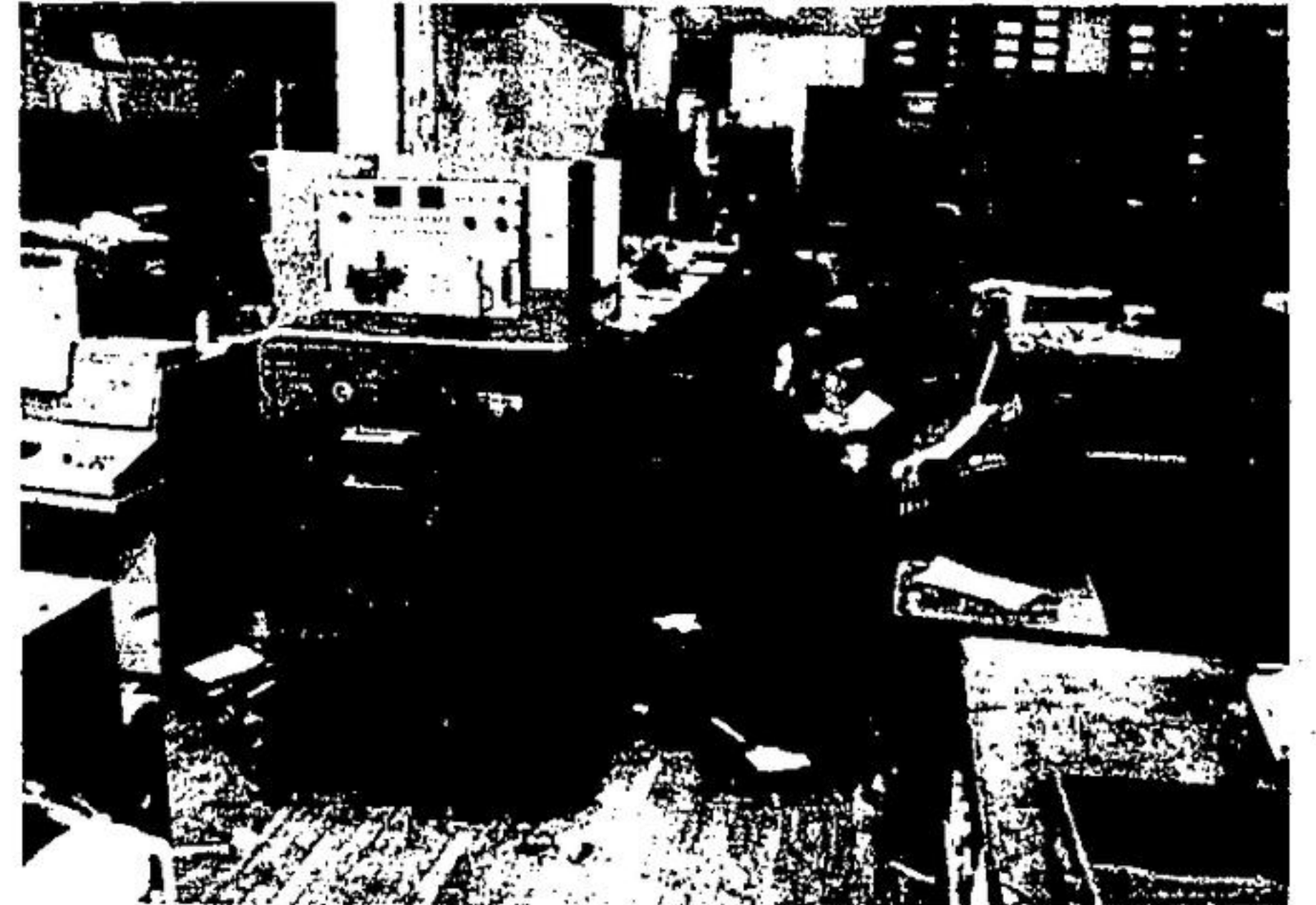
The clutter and the creaking floors characterized The Herald's old headquarters on Main Street. Seen here typesetters proofread copy in the back shop.