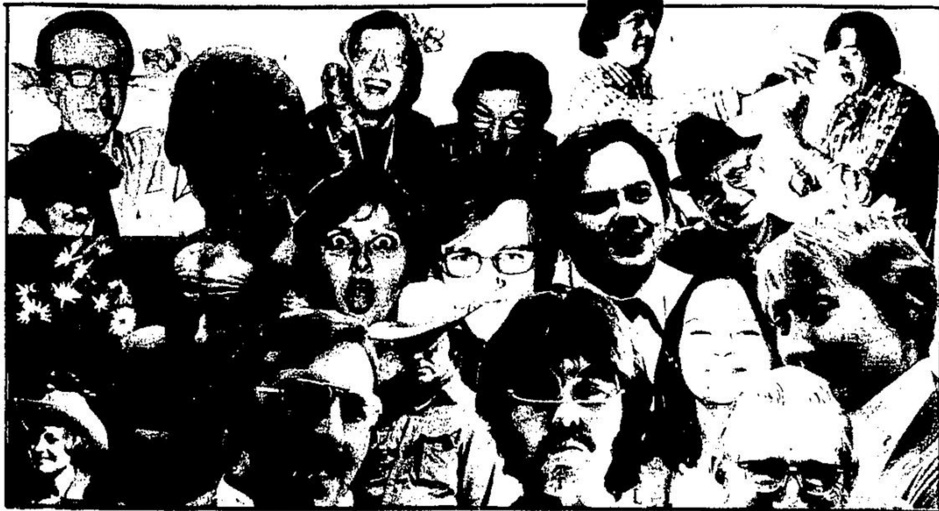
A TIP OF THE HAT TO SOME FORMER STAFFERS